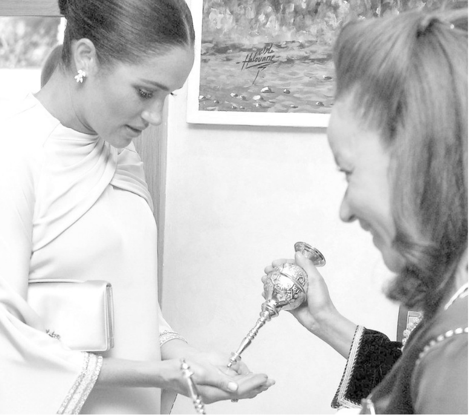
Duke and Duchess of Sussex in Morocco: The duchess received a traditional rosewater greeting at a reception at the British ambassador's residence. She used her speech at the event to spread a message of female empowerment, telling the audience: "Women have to challenge everywhere in the world."

Other tests include tie-ups between grocery seller Kroger Co and selfdriving car startup Nuro, as well as DoorDash and General Motors Co's Cruise Automation. Reuters