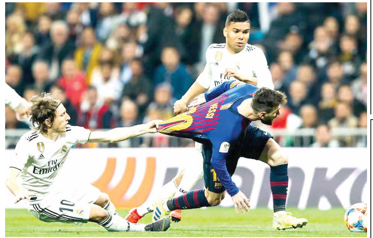
Real Madrid's Ballon d'Or winning midfielder Luka Modric pulls Lionel Messi's shirt in an attempt to stop the world's best player during Wednesday's Copa del Rey el Classico at the Bernabeu. Barcelona won 0-3 on the night and 4-1 on aggregate to reach their 6th straight final in the competition

"We are sad, we wanted to play in the final," Solari said.