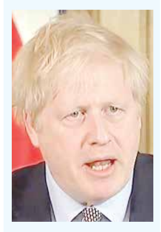
British Prime Minister Boris Johnson