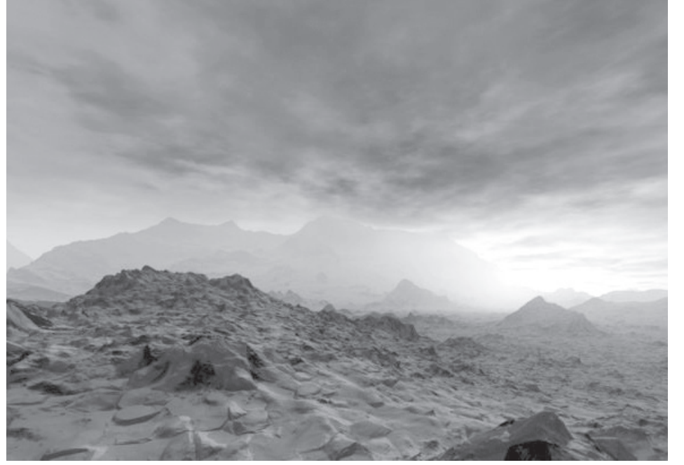
Planet Venus: The phosphine is detected at mid-latitudes

"I'm trying to be the voice of millions of Rwandese who have no-one to speak out for them."BBC