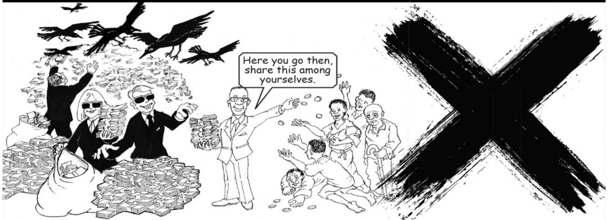
Bwalya Ng'andu's 2021 PF budget'