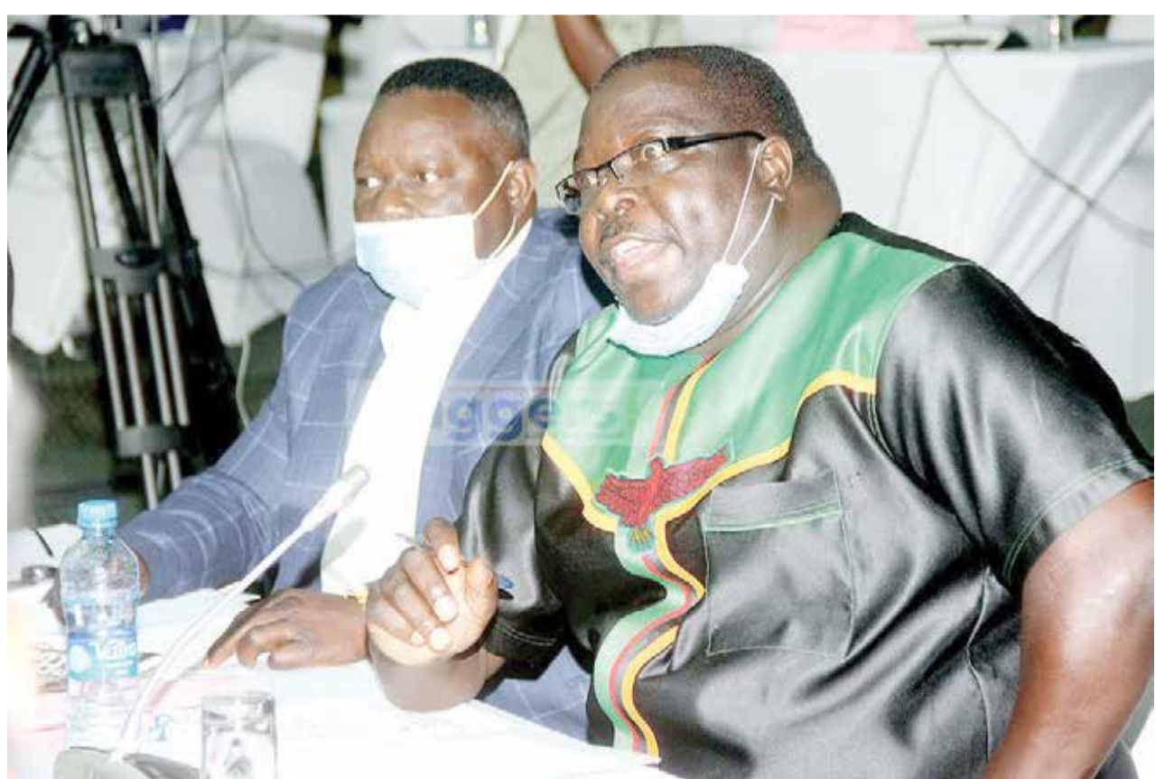
NDC leader Chishimba Kambwili speaks during the ECZ summit at Mulungushi International Conference Center in Lusaka yesterday