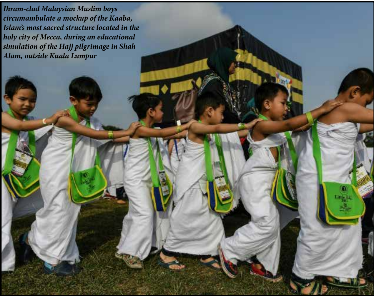
Ithram-clad Malaysian Muslim boys circumambulate a mockup of the Kaaba, Islam's most sacred structure located in the holy city of Mecca, during an educational simulation of the Hajj pilgrimage in Shah Alam, outside Kuala Lumpur