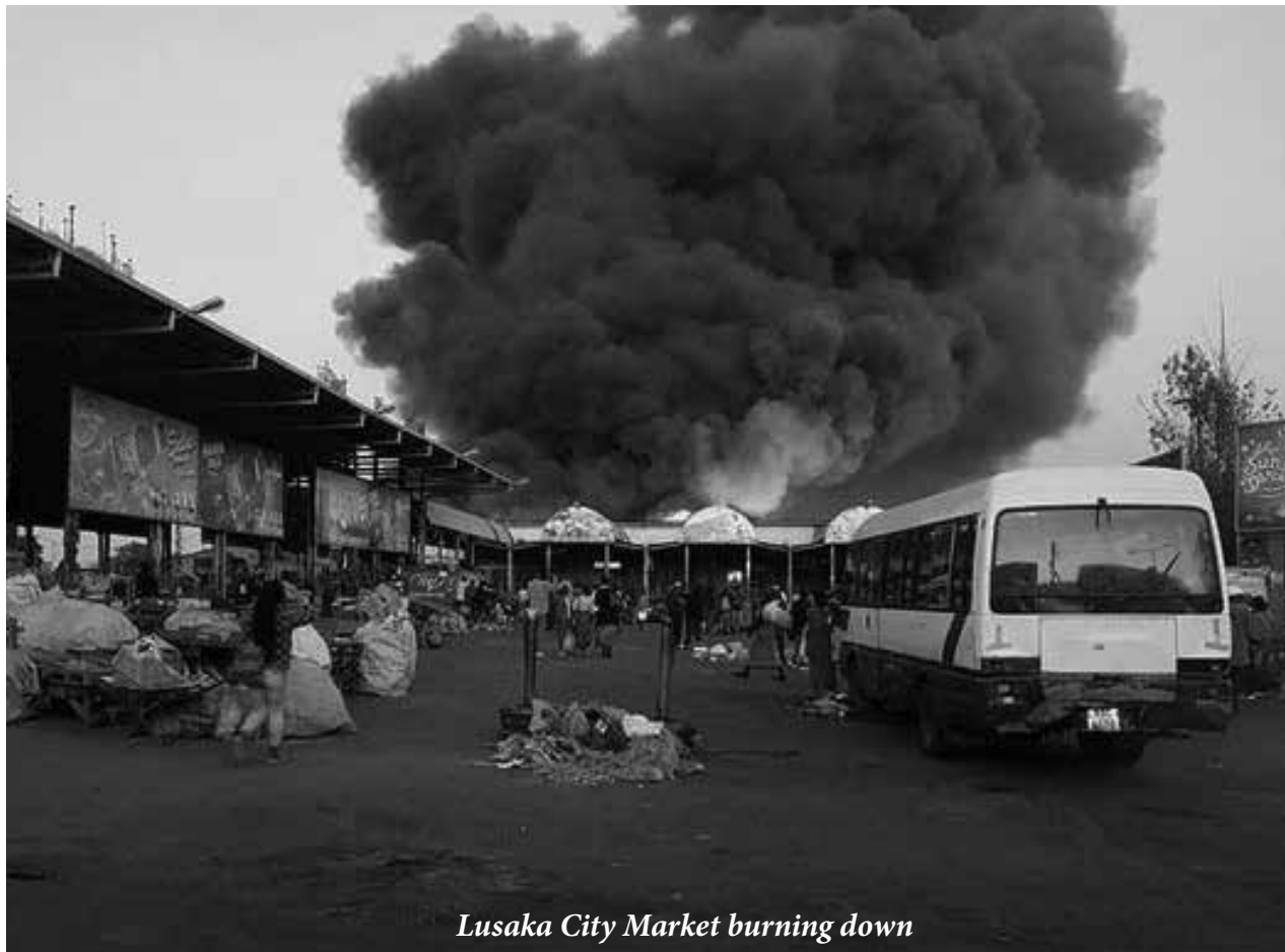
Lusaka City Market burning down