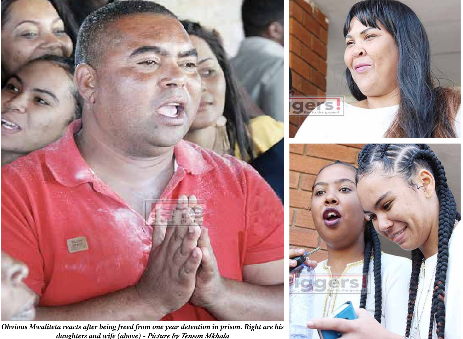
daughters and wife (above)