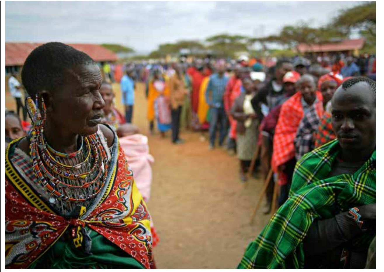
Maasai voters queue before voting at a polling station in Saikeri, Kajiado West County

results of Tuesday's vote. "During this critical phase, we urge all Kenyans to exercise restraint as we await official results from the polling stations and indeed as they start trickling in," the commission said. However, it admitted that a lack of mobile data coverage had delayed the delivery of the supporting documents, forms 34A and 34B. BBC News