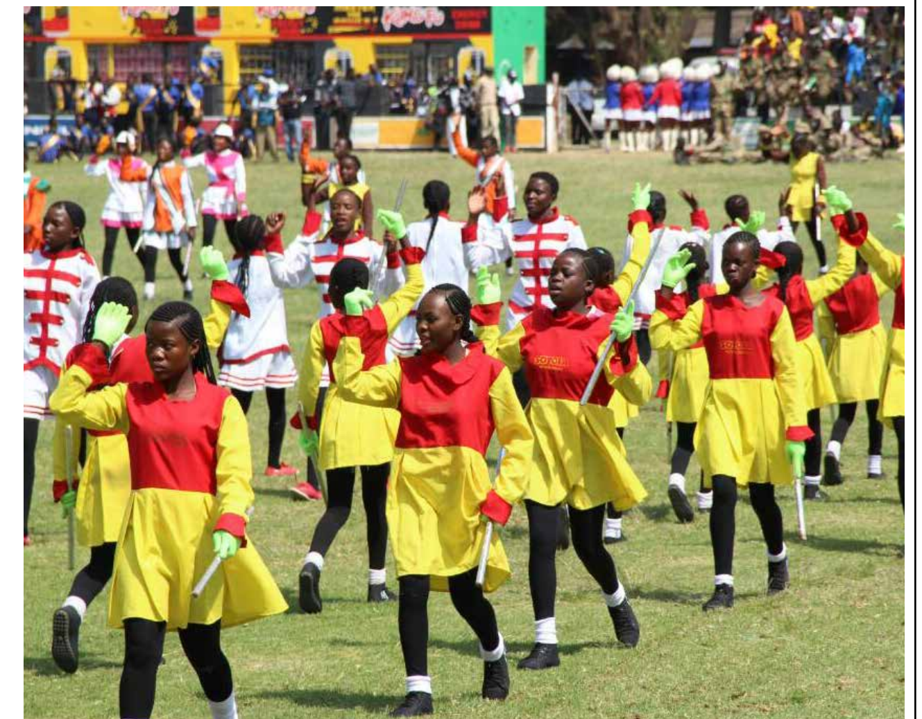
Majorettes from different parts of the country perform during the 91st Agriculture and Commercial show

"These consultations start now and I want to assure the public through you that there won't be an extension for this. Following the successful completion of the consultative process with stakeholders, the Ministry of Justice intends to have the bill ready for the introduction in Parliament in the September to December of 2017. In order to ensure that stakeholders have timely access to the draft Political Parties Bill, 2017, I am pleased to inform you that the bill will be available on the websites for: the Ministry of Information and Broadcasting, Ministry of Home Affairs; Zambia Development Commission; and Law Association of Zambia. Stakeholders may also collect hard copies of the draft bill from the Ministry of Justice, office of the Permanent Secretary." And Lubinda said there were a lot of challenges that had led to the poor performance by ZIALE. "I cannot pre-empt this vet but one of the reasons according to the submissions I have received so far that has led to the poor performance at ZIALE is the preference of private colleges and Universities as opposed to Public Universities. But I am yet to issue a full report to this effect because right now I am still receiving submissions," said Lubinda.