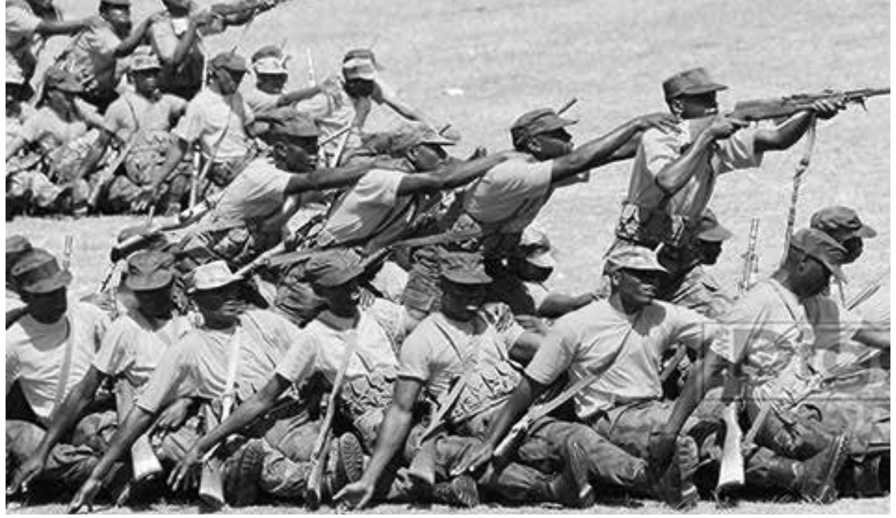
ZNS officers perform at the 91st Agriculture show in Lusaka

human rights defenders in line with their constitutional mandate and it is deeply regrettable that they have to pay with their own lives in the course of securing the rights of others. The Commission deeply commiserates with the Zambia Police Service and the families of the deceased officers. The deprivation of the right to life constitutes terminal violation of human rights and must at all cost be prevented as life lost cannot be restored"