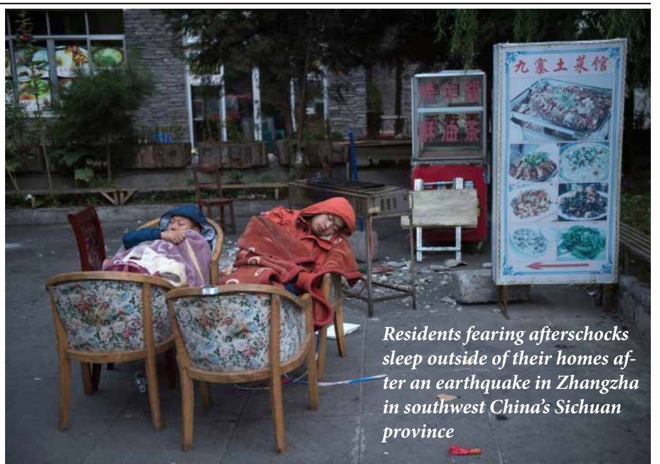
Residents fearing aftershocks sleep outside of their homes after an earthquake in Zhangzha in southwest China's Sichuan province