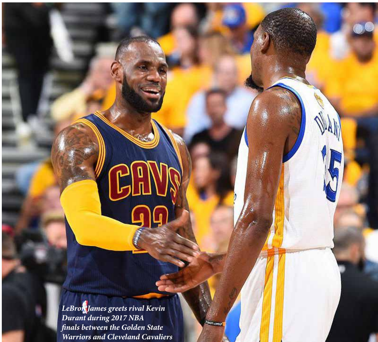
LeBron James greets rival Kevin Durant during 2017 NBA finals between the Golden State Warriors and Cleveland Cavaliers

"But it was a personal decision; it was to do with sporting ambition. If it had been for my team-mates, I would have stayed. I left because I want to succeed in football, to do great things. I'm at the best place to do that." Goal.com