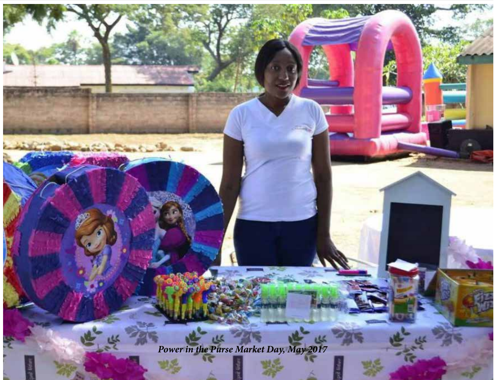
Power in the Purse Market Day, May 2017