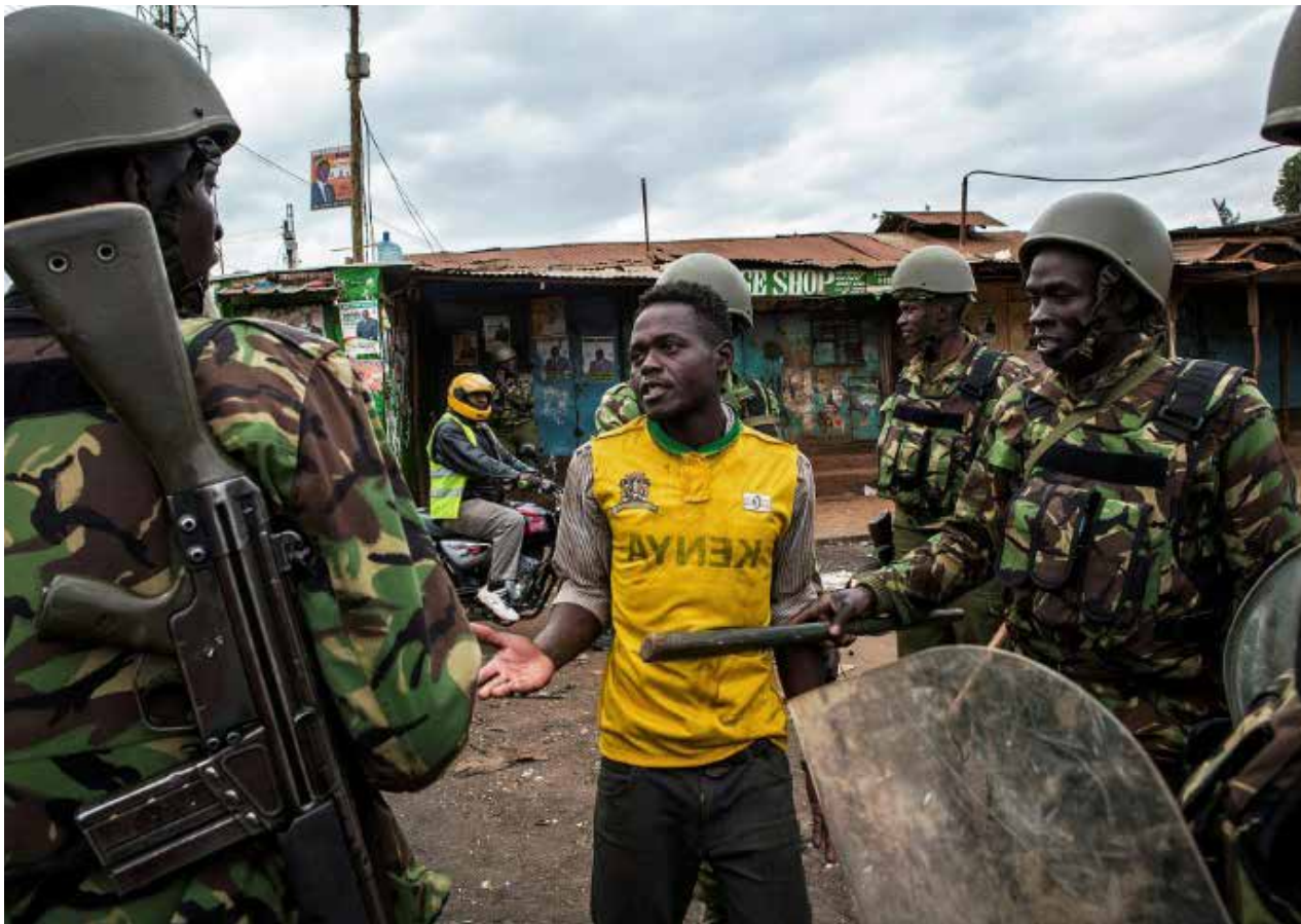
Kenyan police question a suspected protestor in the Kawangware slum of Nairobi

The president, who is on a working holiday at his golf club in Bedminster, New Jersey, also told reporters he had not thought about the possibility of firing Mr Mueller, who was appointed as special counsel in May following Mr Trump's sacking of then FBI Director James Comey.