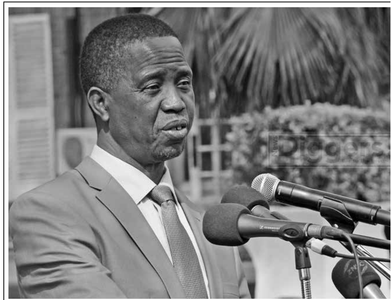
President Edgar Lungu speaks to journalists during a press conference at State House on July 6, 2017 - Picture

stations be looking at the fact that these people are coming from various places where they are registered from. So it's not a question of their rights but it's a question of also ensuring people don't take advantage of this provisional for the prisoners to rig the elections."