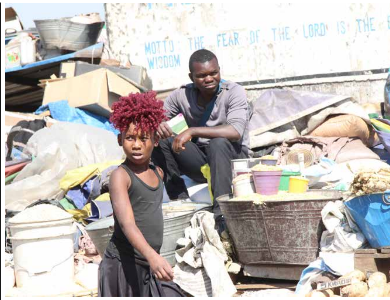
A man of Lusaka's Mtendere township at his stand as he sells maize

"In the meantime, we call upon our employees to remain calm and not panic because the situation