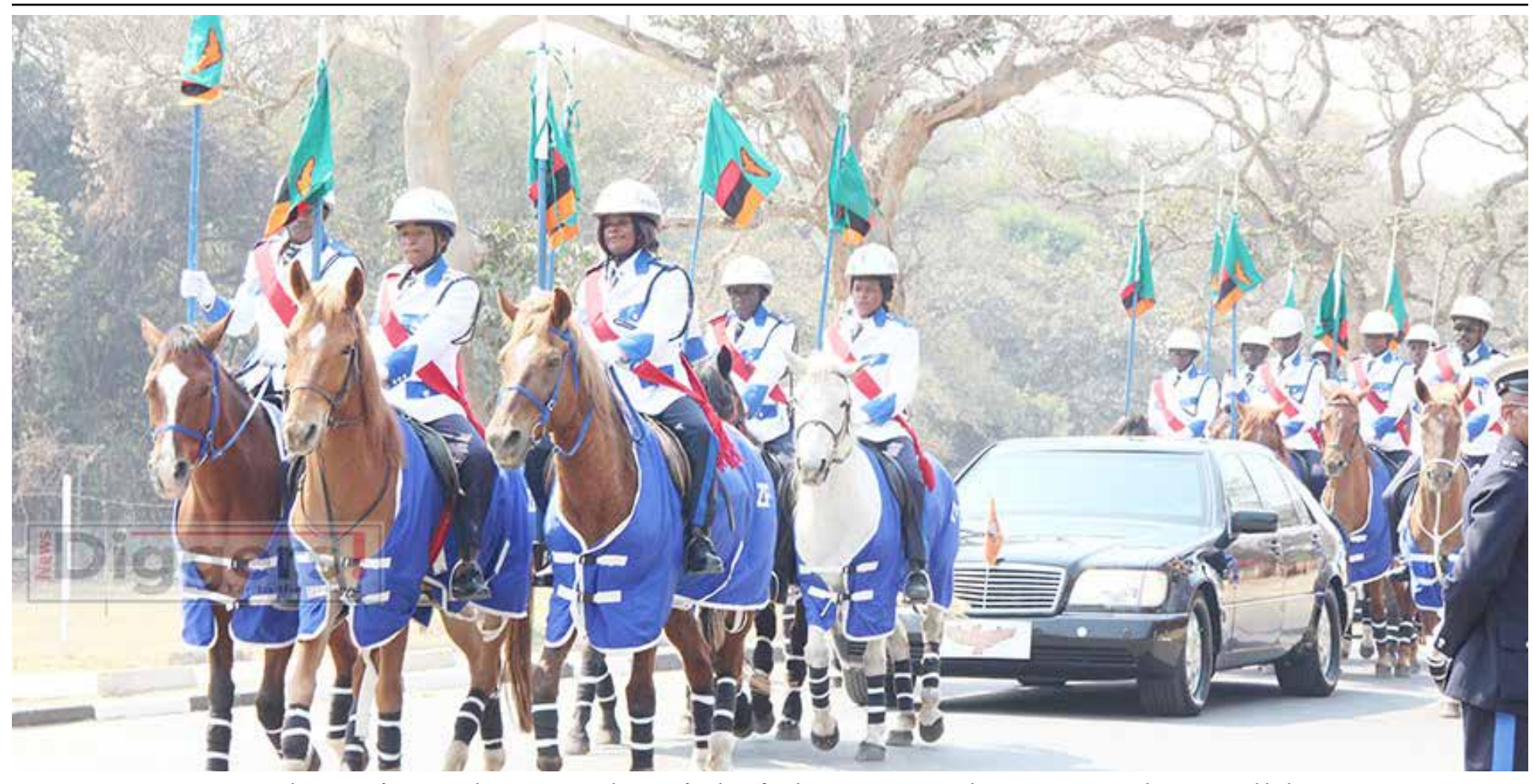
President\ Lungu's\ motrocade\ arrives\ at\ Parliament\ for\ the\ official\ openning\ on\ Septmber\ 15,\ 2017\