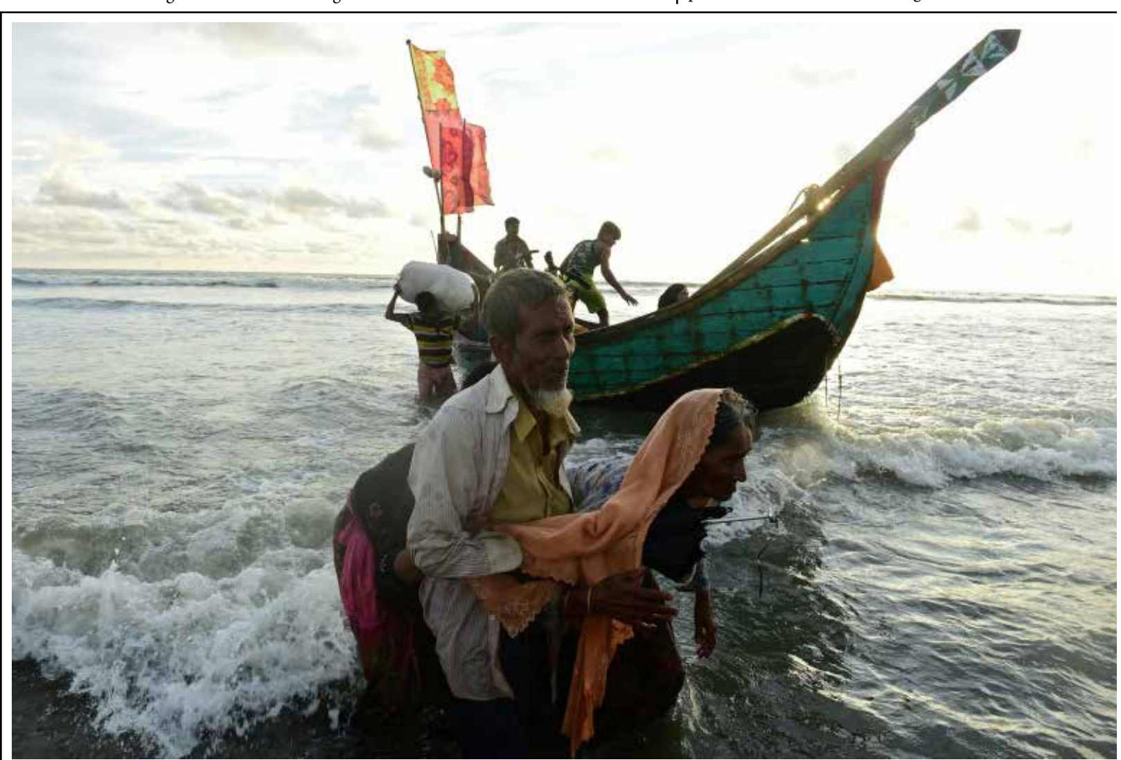
Rohingya refugees disembark from a boat after crossing the border from Myanmar, on the Bangladeshi shores of the Naf river in Teknaf

The move freezes any assets they may hold in the US and prohibits Americans from doing business with them.