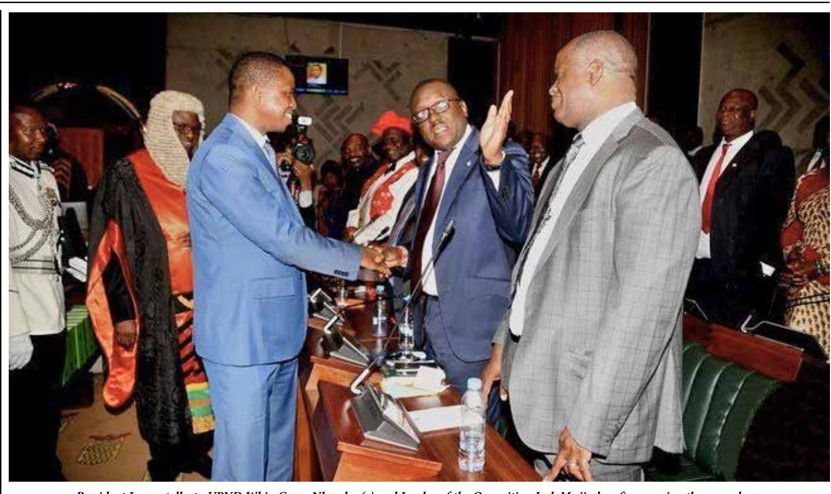
President Lungu talks to UPND Whip Garry Nkombo (c) and Leader of the Opposition Jack Mwiimbu after opening the second session of the 12th National Assembly today