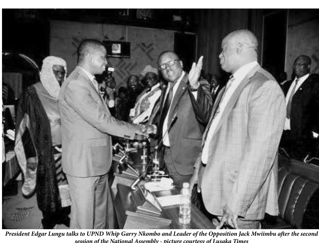
session of the National Assembly

UPND to agree and put their differences together because reconciliation was the only thing that could heal the country.