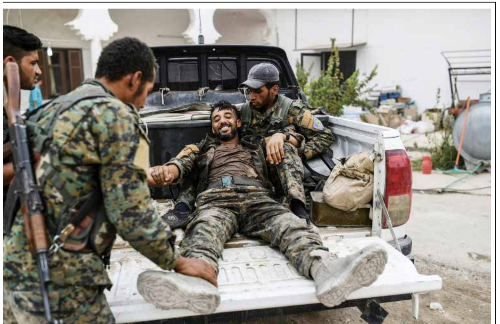
A heavily wounded member of the Syrian Democratic Forces smiles as he arrives at a medical centre on the eastern frontline of Raqa

Only "certain Venezuelan government officials and their immediate family members" have been banned - its government has recently been hit with economic sanctions by the US, who now say it does not co-operate "in verifying whether its citizens pose national security or public-safety threats" and does not receive deported nationals willingly. BBC News