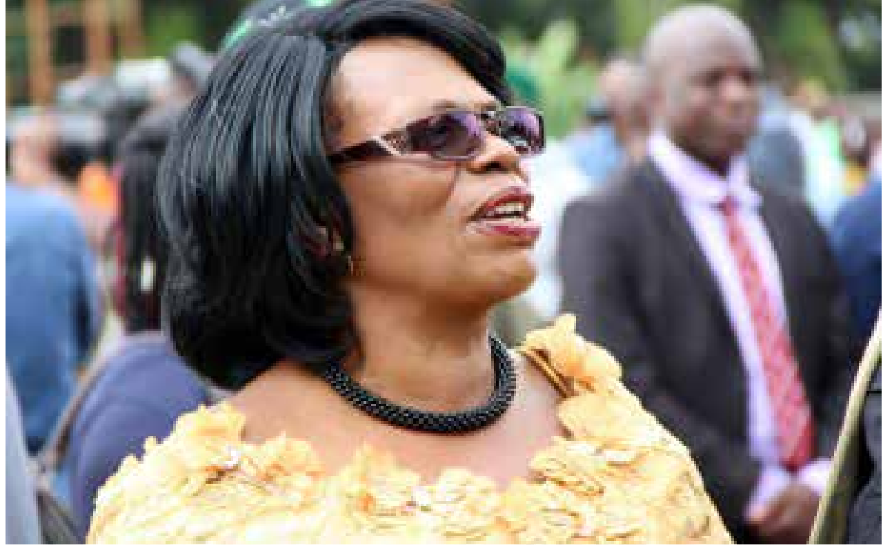
Minister of Higher Education Nkandu Luo

They wondered how two people could live in the same house without knowing each others' whereabouts.