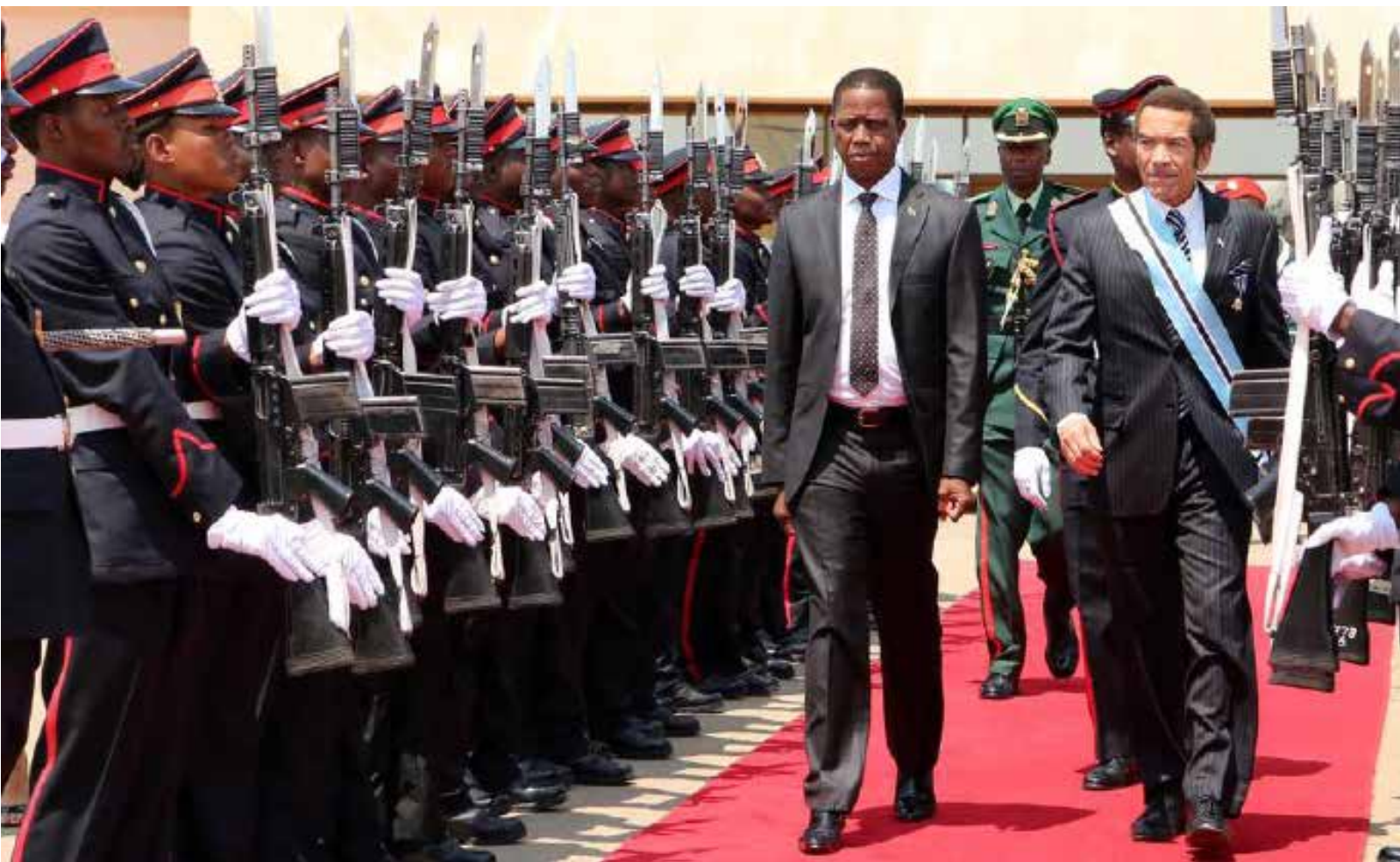
President Edgar Lungu inspects a Guard of Honour on his most recent trip to Botswana

is bringing on this road. That is the difference and a huge benefit to this government. The internal rate of return at 15 percent Mr Speaker as indicated that by the 17th year when we are done with repaying of this road, this government will have raised up to 3.5 billion dollars we subtract 1.2 billion dollars including other administrative costs, this government will remain with a net profit of 1.5 billion dollars. I think Zambians must say ‘job well done’ to President Edgar Lungu’s government.”