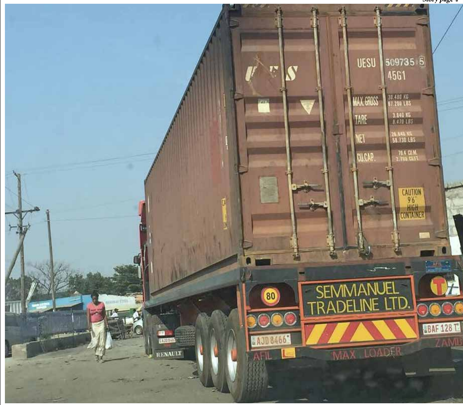
A truck loaded with Mukula logs parked at Lusaka's Garden Compound Police this morning

...goes bad, partners turn on each other