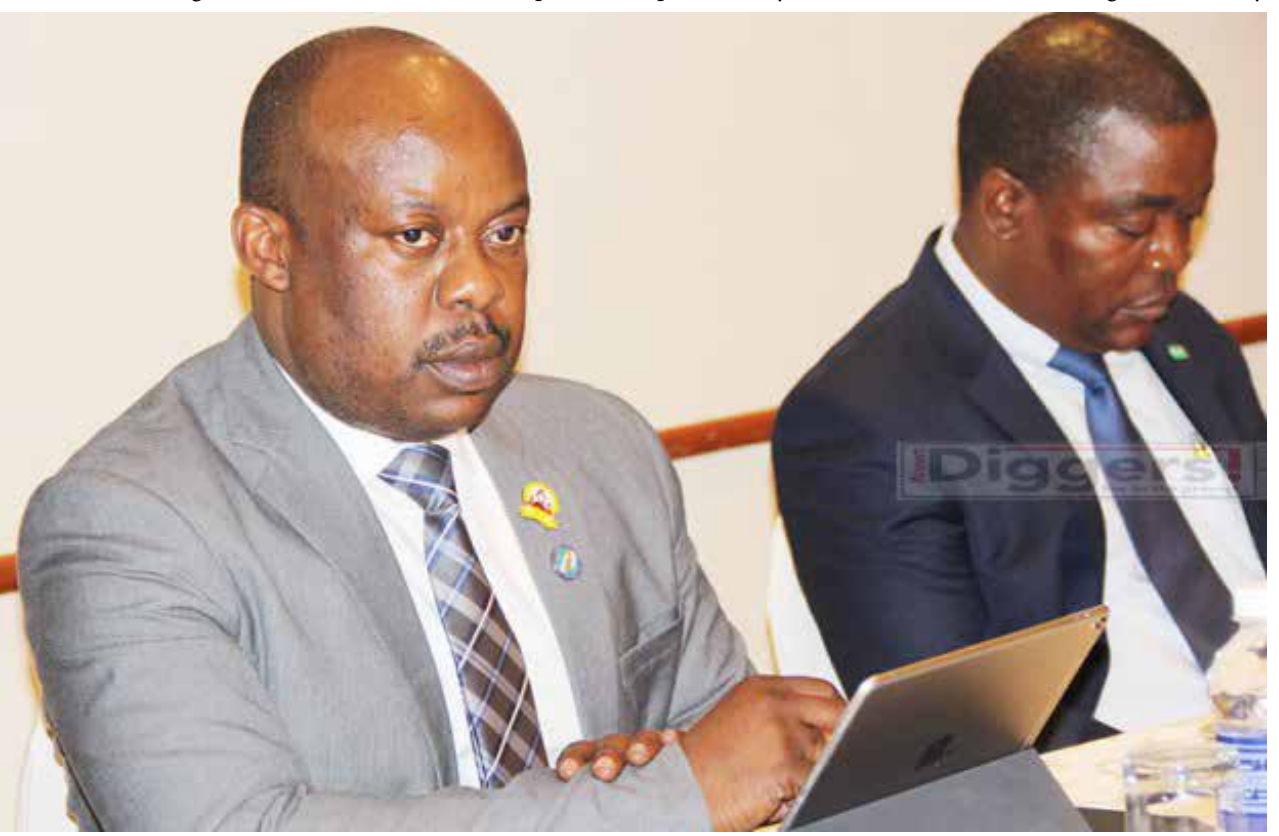
Road Transport and Safety and Agency (RTSA) director Zindaba Soko at the ministry of Transport and Communication press briefing in Lusaka's Pamodzi hotel on October 5, 2017.

partnership "The intended to reduce the rising incidences of road crashes and fatalities to improve the road safety record of our country and improve the provision of services to the public. This partnership will help improve the performance of RTSA on its core mandate and build capacity in RTSA to use modern methods of law enforcement using electronic systems."