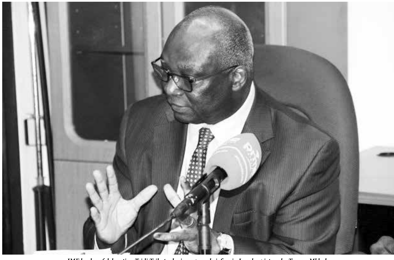
IMF leader of delegation Tsidi Tsikata during a press briefing in Lusaka

strengthen human capital and support financial inclusion for small and medium scale enterprises. Domestic risks to the outlook include delayed fiscal adjustment which would continue to crowd out credit to private sector and entrench an unsustainable debt situation, and unfavorable weather conditions which would affect hydro power generation and agricultural output. External risks include tighter global financial conditions and volatility in the world copper price.