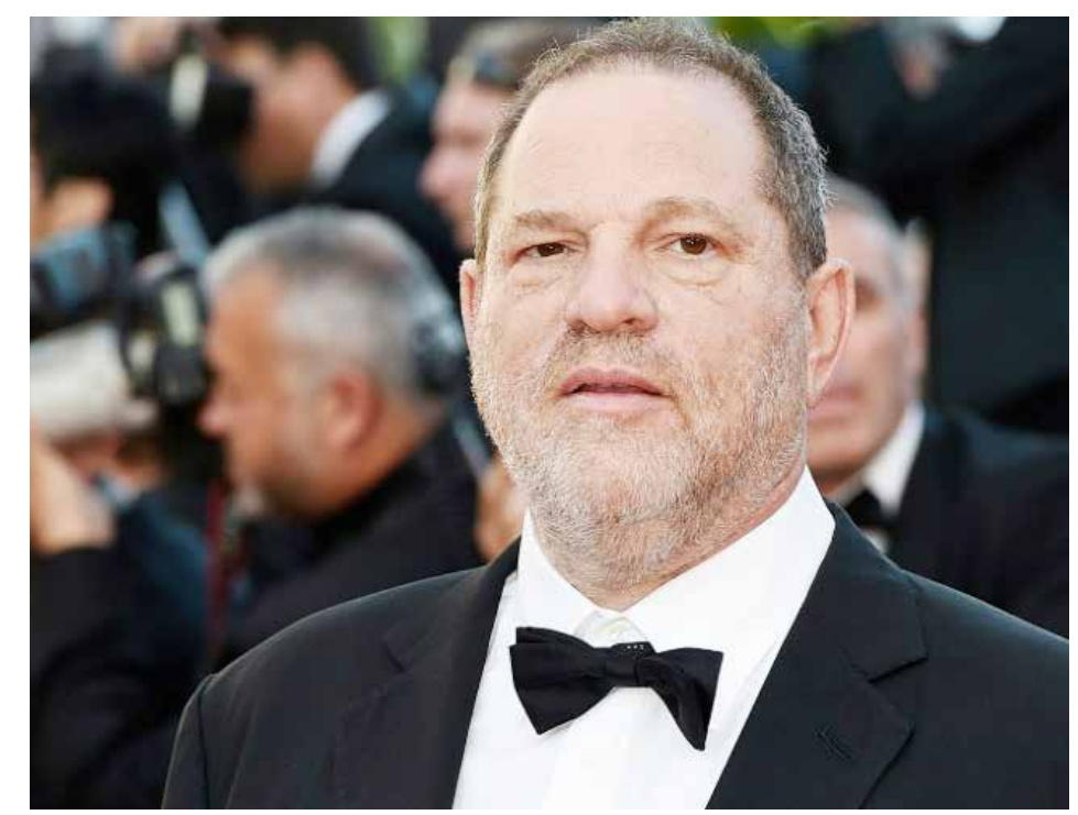
Oscar-winning producer Harvey Weinstein was sacked this weekend from The Weinstein Company following a series of sexual harassment allegations