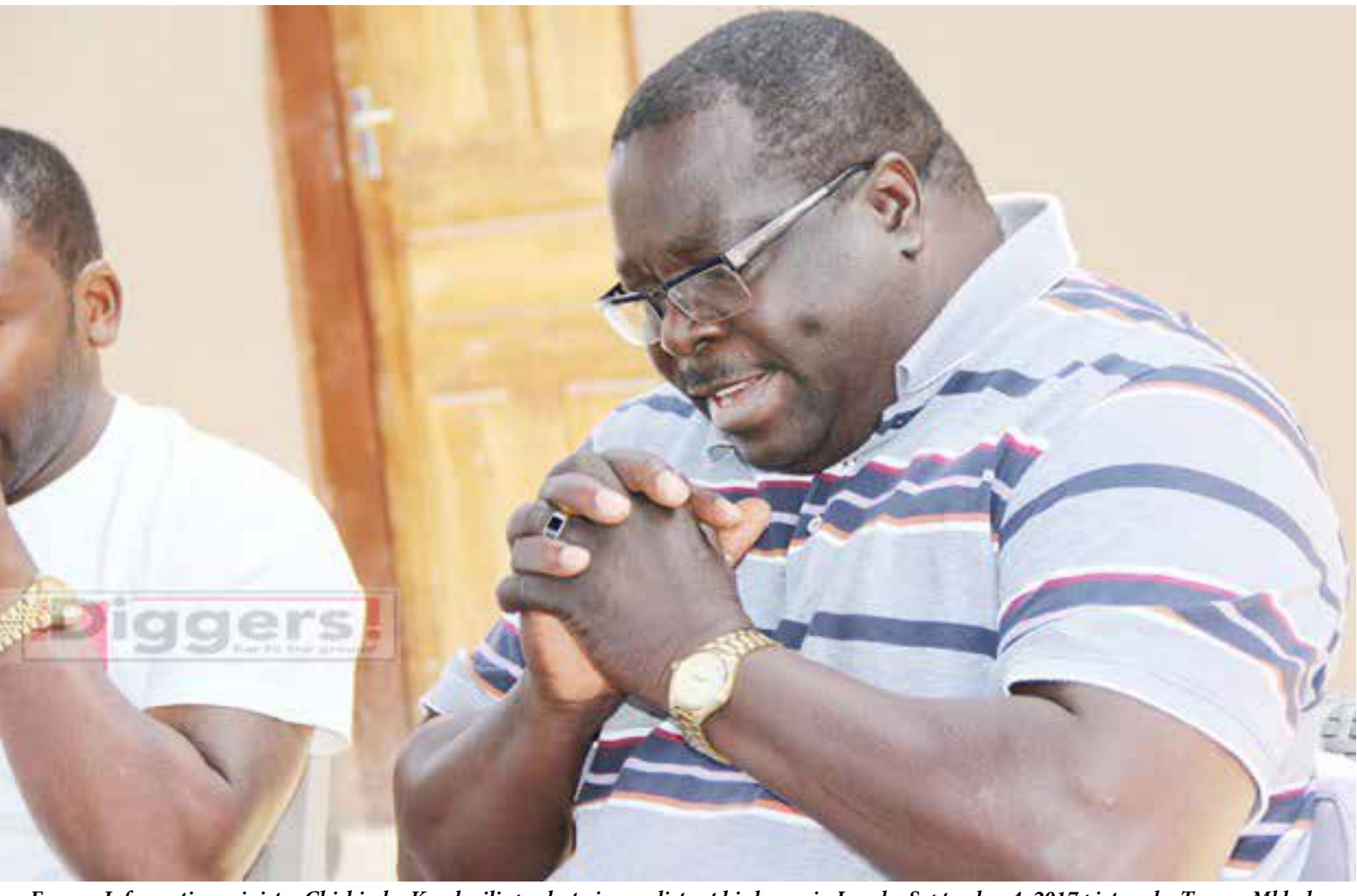
Former Information minister Chishimba Kambwili speaks to journalists at his house in Lusaka September 4, 2017

"My expectation is that people will go to the prayer genuinely, and I am using the word 'genuinely', to pray for national building, reconciliation fostering development by putting the poor people