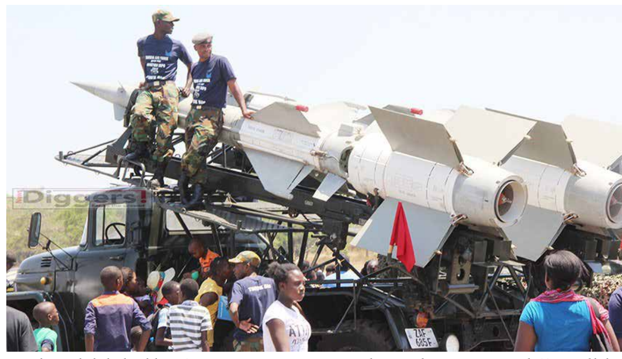
A military vehicle displayed during ZAF Open Day at City Airport in Lusaka on October 14, 2017