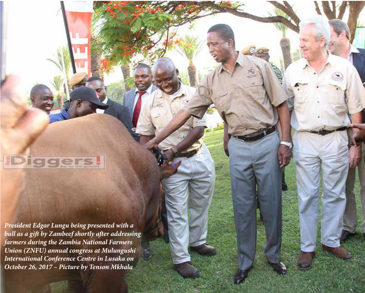
President Edgar Lungu being presented with a bull as a gift by Zambeef shortly after addressing farmers during the Zambia National Farmers Union (ZNFU) annual congress at Mulungushi International Conference Centre in Lusaka on October 26, 2017