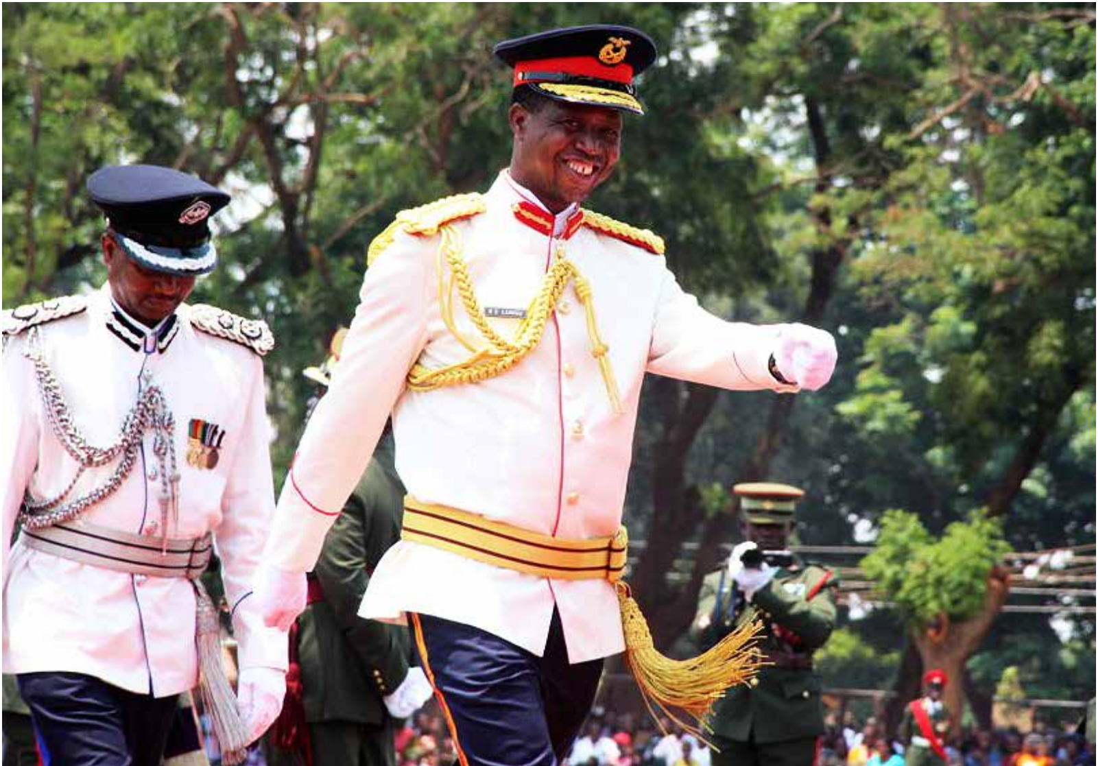
President Lungu marches during the Trooping and Consecration of Colours parade at Arakan Barracks in Lusaka today