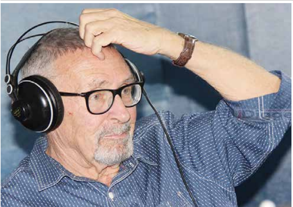
Former vice-president Dr Guy Scott eulogises Michael Sata on 5FM Radio yesterday See story on Page 3