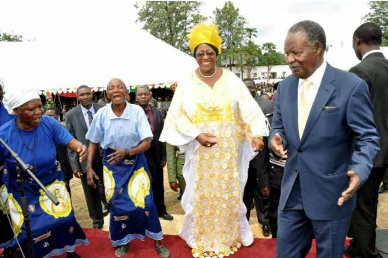
President Michael Chilufya Sata with first lady Dr Christine Kaseba