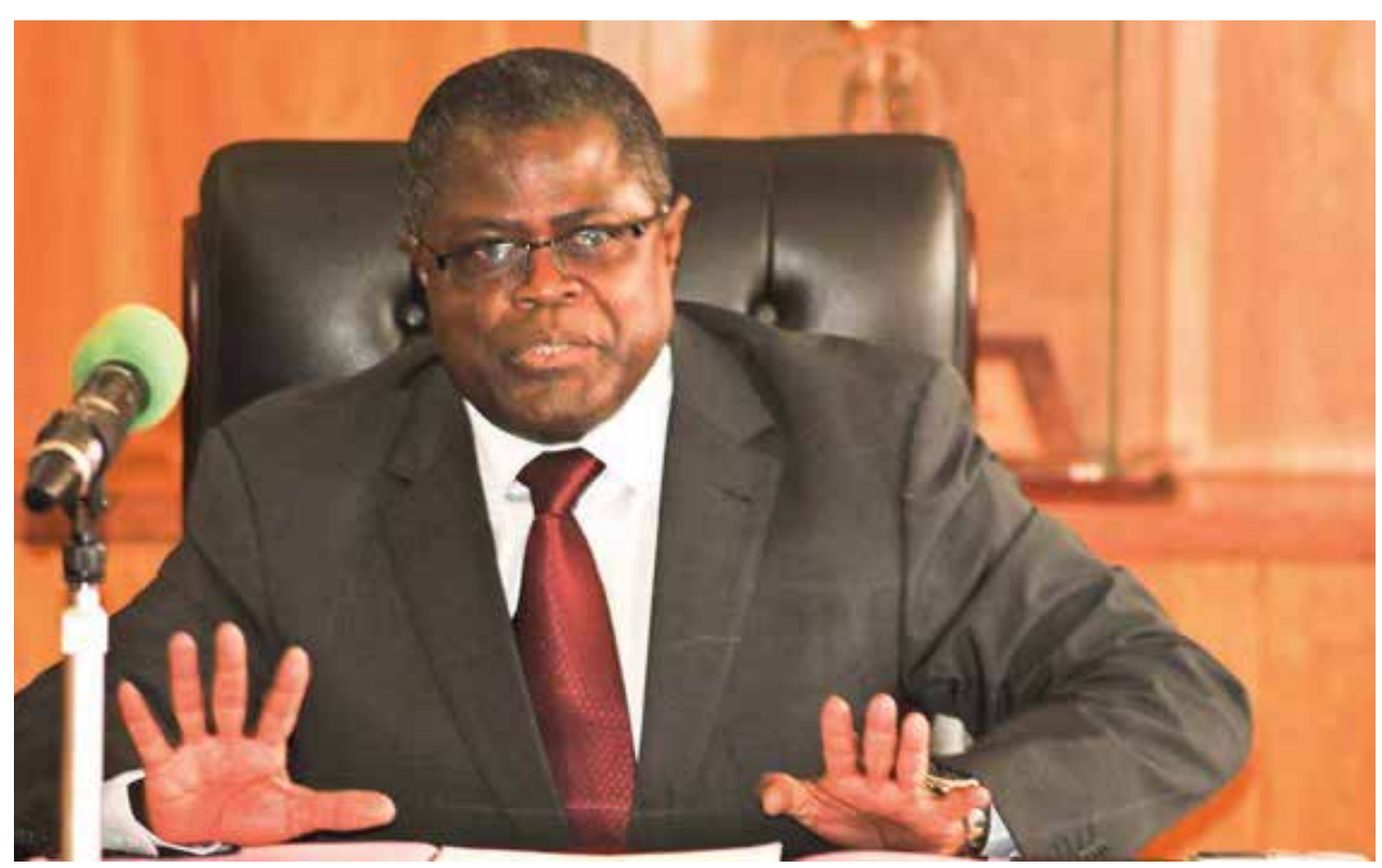
Mines Minister Christopher Yaluma

He also stated that government should not use the suspension of licenses to victimize small