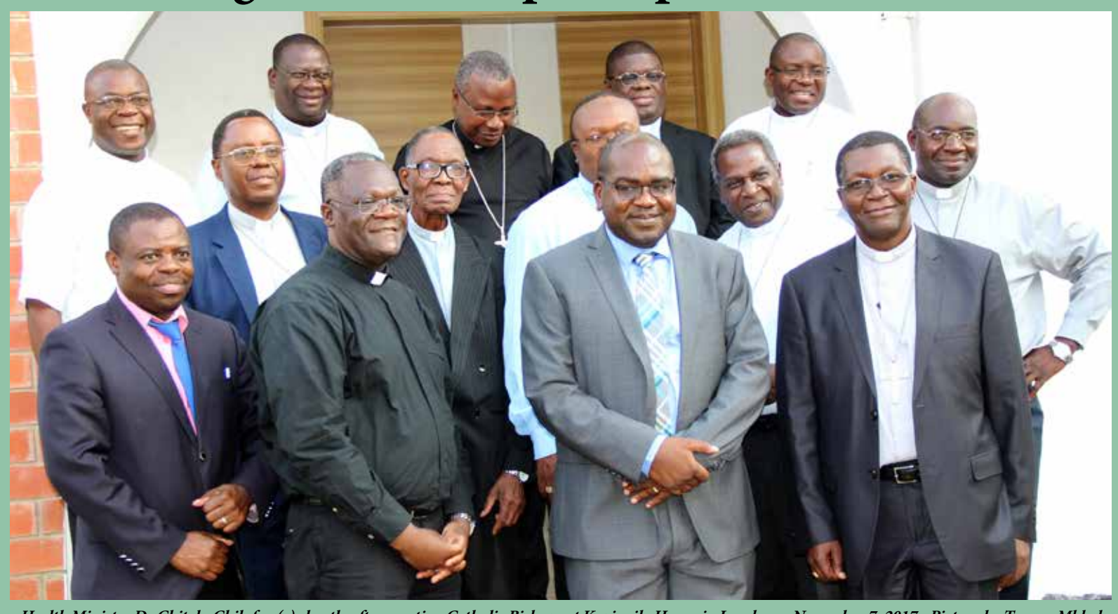
Health Minister Dr Chitalu Chilufya (c) shortly after meeting Catholic Bishops at Kapingila House in Lusaka on November 7, 2017

Dr Chitalu said government would work with the church in order to attain the epidemic control of HIV/AIDS by the year 2021. To page 5