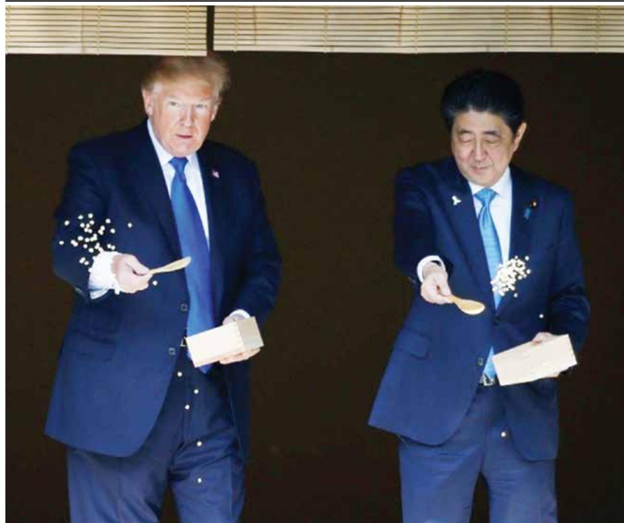
US President Donald Trump (L) and Japanese Prime Minister Shinzo Abe (R) feed koi fish during a welcoming ceremony in Tokyo

Wednesday October 8, 2017 International News. 9