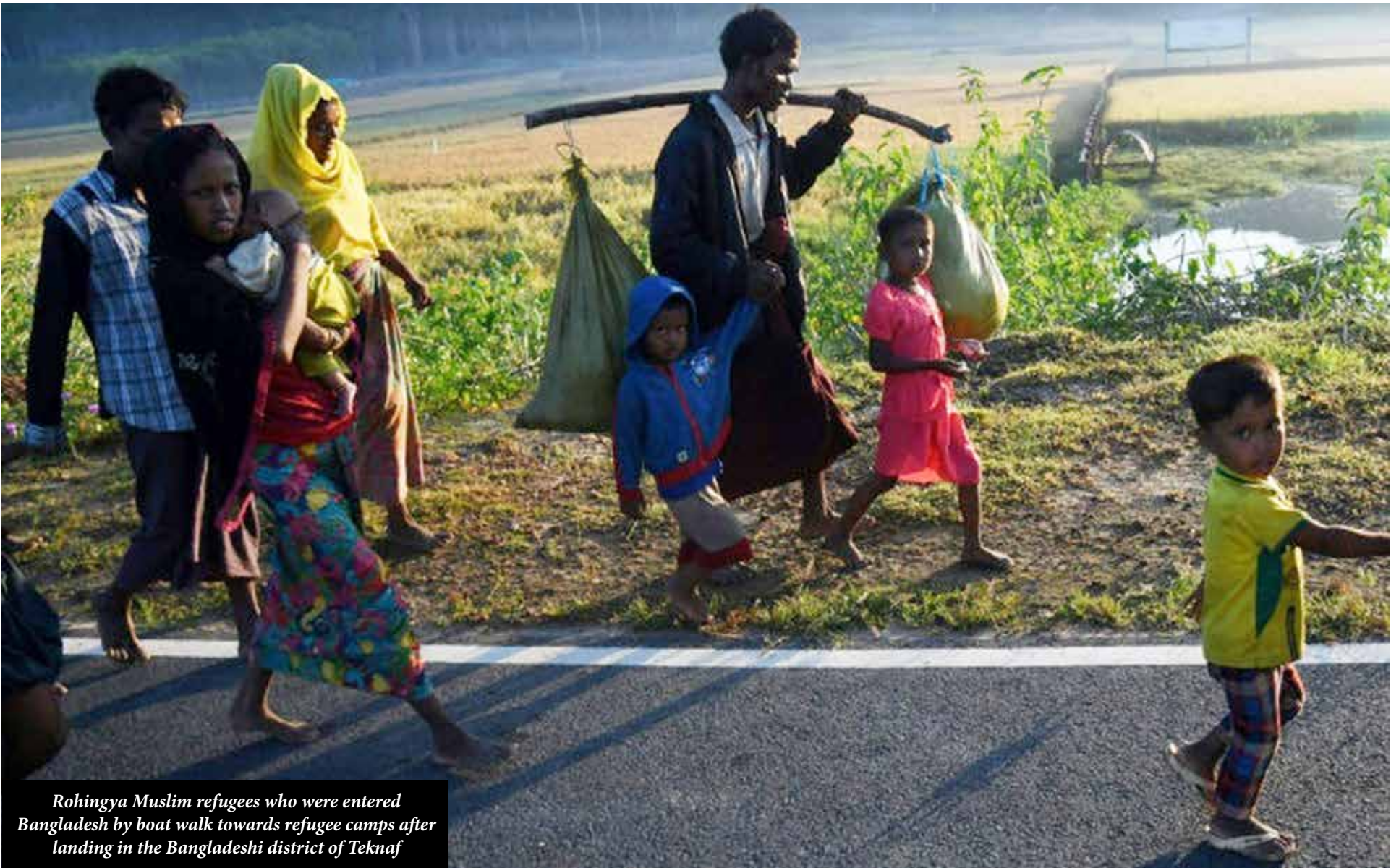
Rohingya Muslim refugees who were entered Bangladesh by boat walk towards refugee camps after landing in the Bangladeshi district of Teknaf