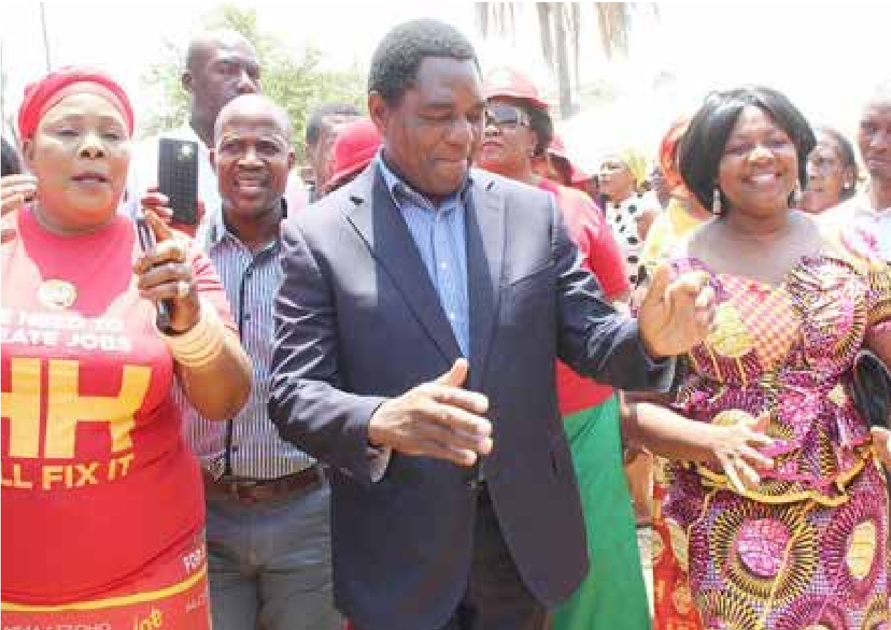
Hichilema joins UPND women in a dance at a party secretariat