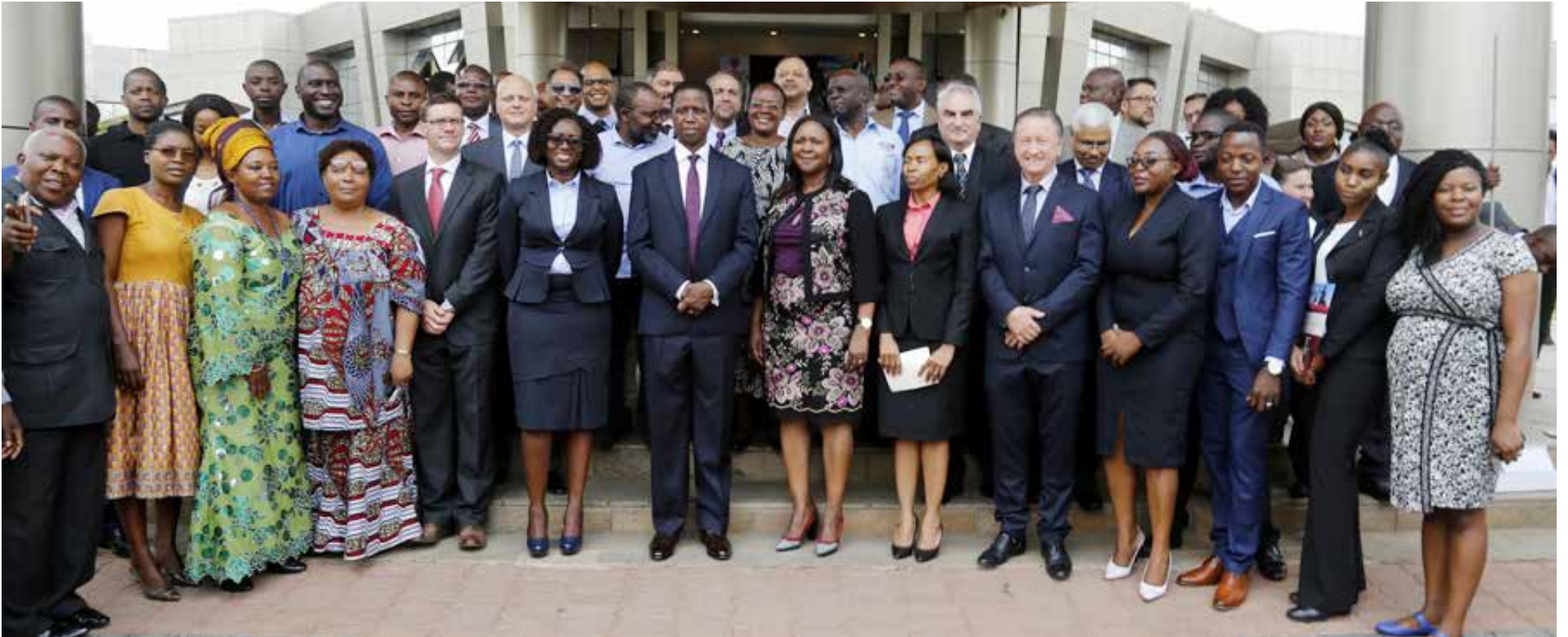
President Edgar Chagwa Lungu (c) with members of the Zambia Association of Manufacturers during the "Meet the President dialogue" at Radisson Blu Hotel yesterday