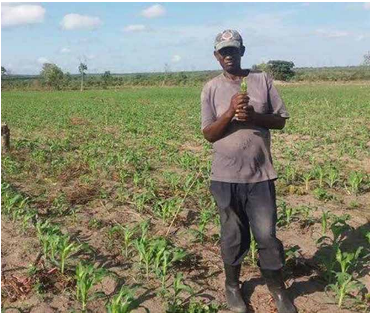
Army worms are back: a farmer displays the damage to maize crops