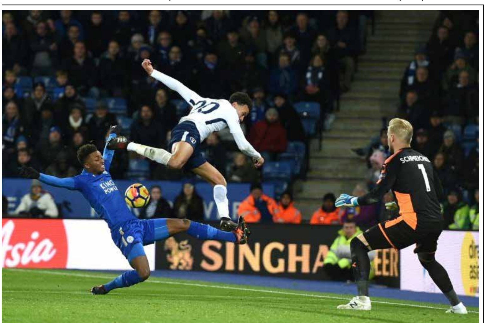
Leicester City's Demarai Gray (L) vies with Tottenham Hotspur's Dele Alli during a Premier League match in Leicester, central England

"We have forest and it is more comfortable for us to win," Chilufya said.