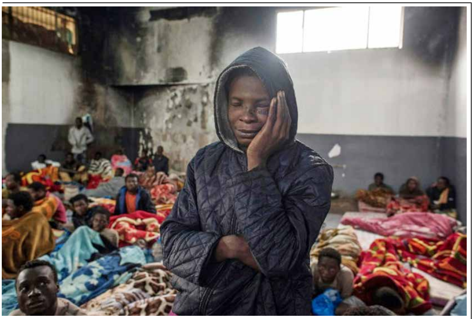
A migrant stands in a packed room at the Tariq Al-Matar detention centre on the outskirts of Tripoli, Libya