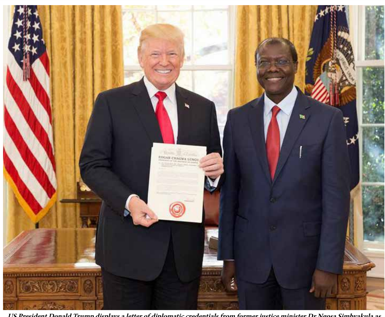
US President Donald Trump displays a letter of diplomatic credentials from former justice minister Dr Ngosa Simbyakula as Zambia's Ambassador to that country

PF has turned agriculture into risky business - ZNFU