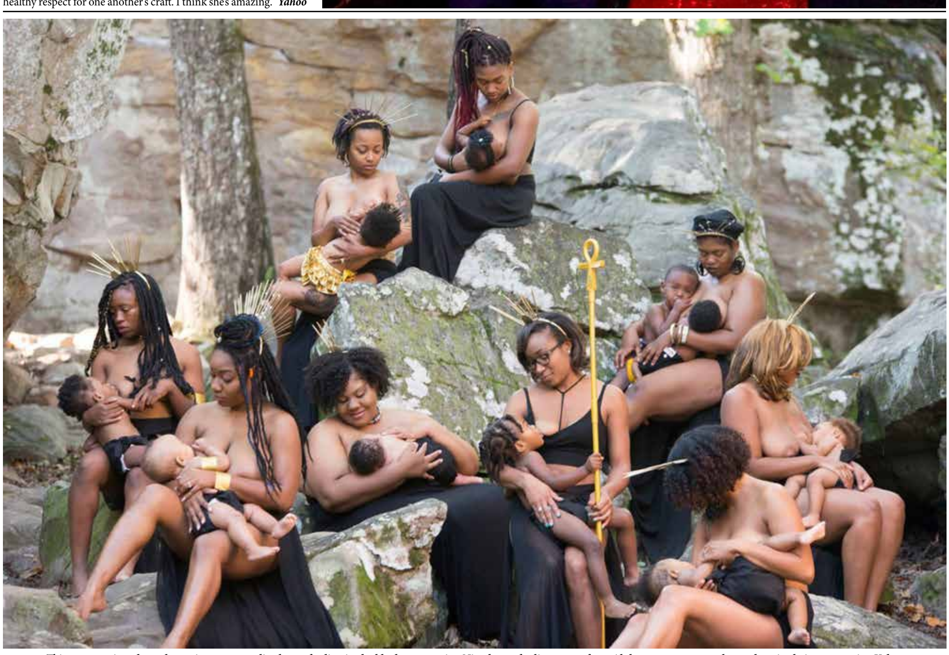
This empowering photo shoot aims to normalize breastfeeding in the black community. Nine breastfeeding moms from Alabama set an example to others in their community.