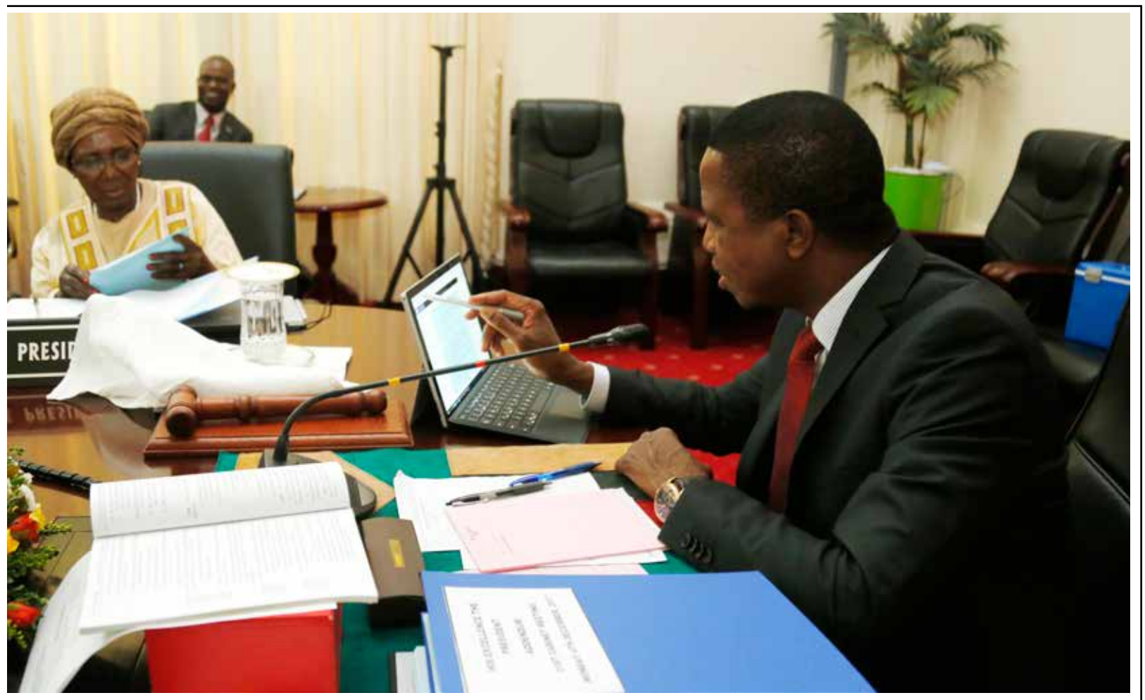
President Edgar Lungu uses his laptop during the 21st Cabinet Meeting at State House in Lusaka today

"The total contribution of agriculture to Zambia's Gross Domestic Product (GDP) averaged 9.8 per cent in the period 2006 to 2015. The government's partnership with UNDP in this regard is helping the country follow a climateresilient development path, consistent with our poverty reduction and sustainable development objectives. My Ministry will endeavor to provide sector and location tailored weather and climate products and services and updates to aid in agriculture activities for a good harvest," said Mushimba.