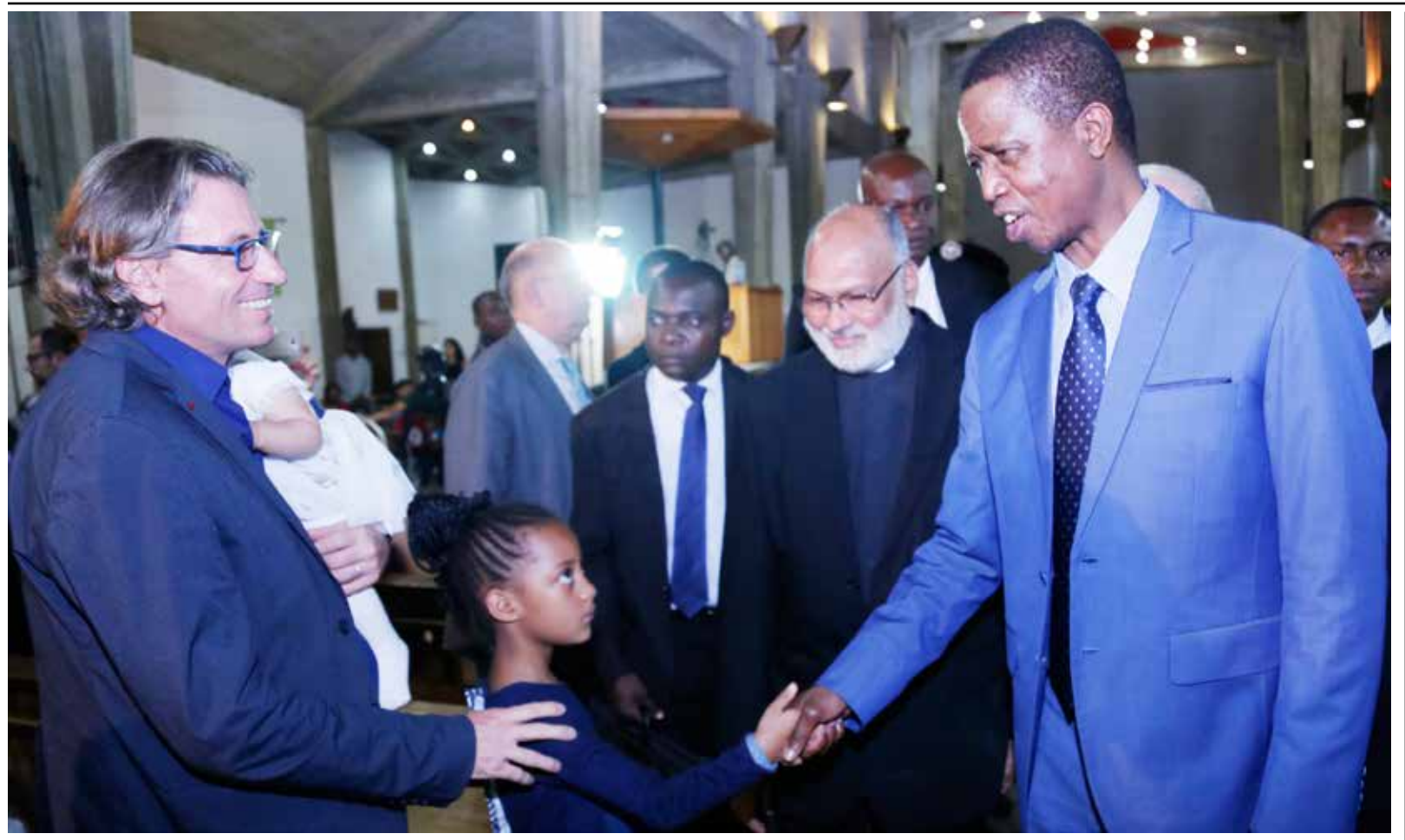
President Lungu greets a child during the Cheshire Homes Kabulonga Concert at the Anglican Cathedral of the Holy Cross in Lusaka on Friday December 1, 2017