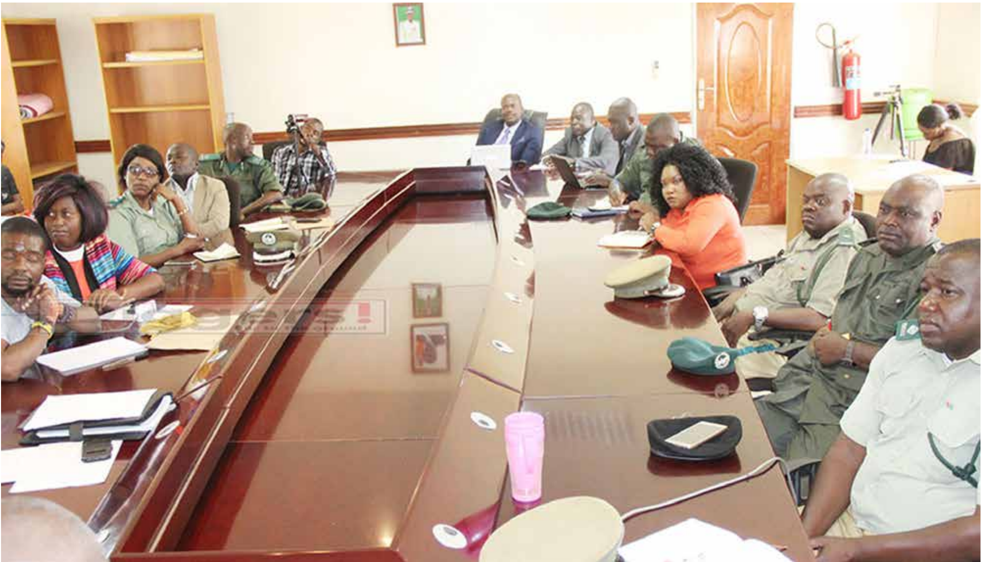
Correctional service officials during the commemoration of human rights in Lusaka