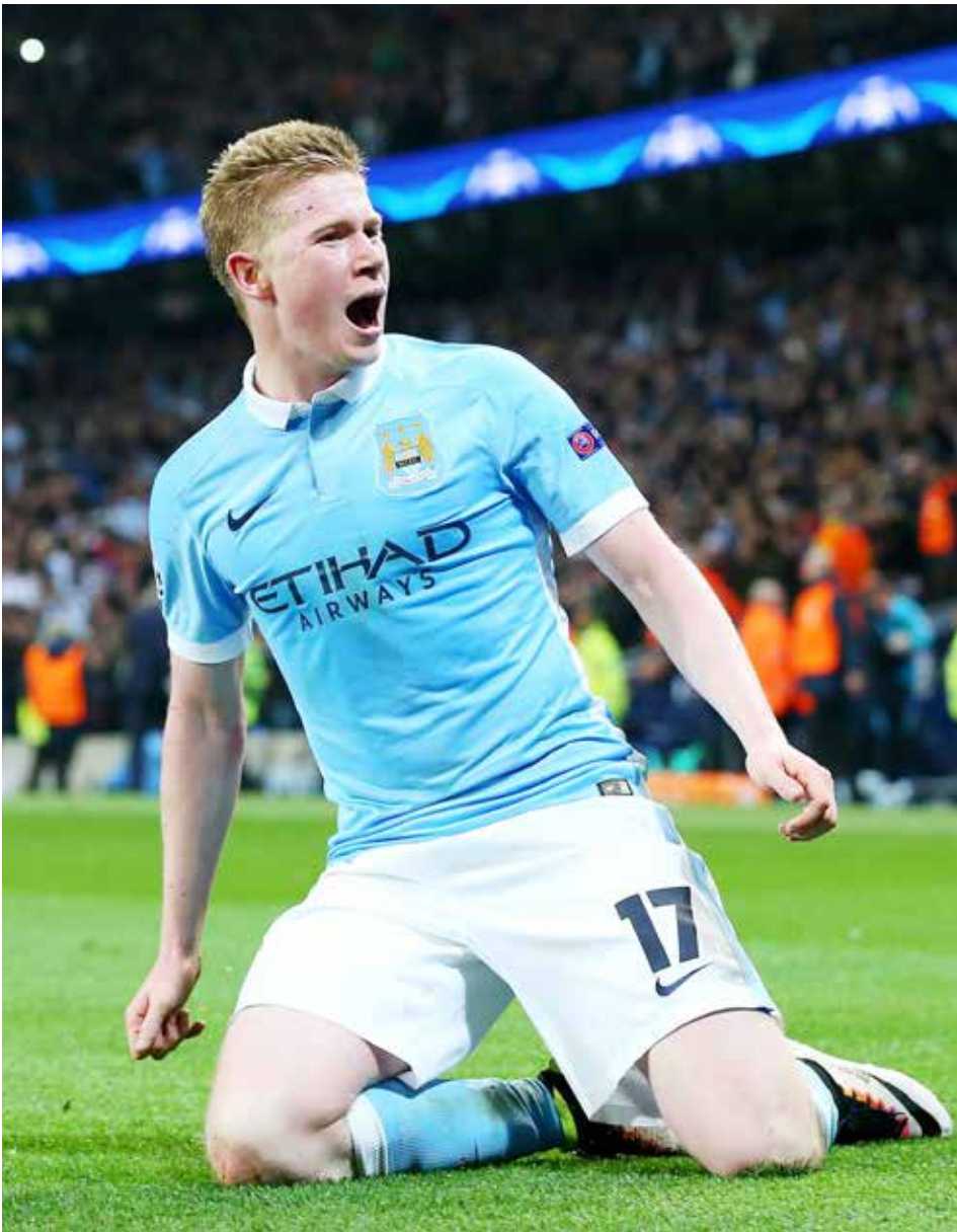
Kevin De Bruyne

It may seem unfair, but De Bruyne’s bid for glory is hampered by his lack of goals. The dominance of the current top two has raised the bar in terms of attacking output - setting up chances for others helps, but scoring yourself for a successful side clinches the deal. At least the Belgian is at a club with lofty ambitions, as Manchester City look capable of becoming a European superpower with Pep Guardiola at the helm.