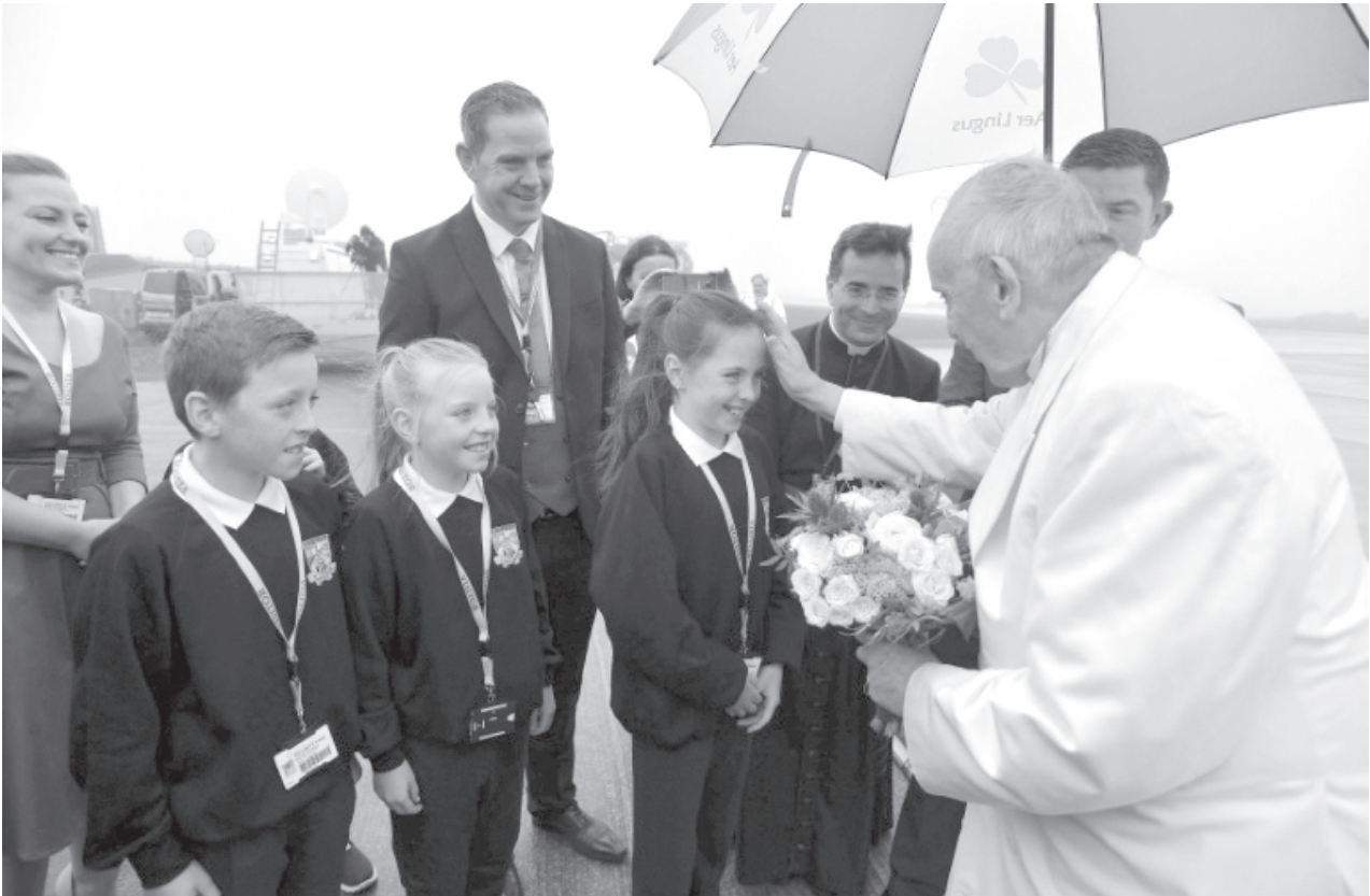
Pope Francis at Knock Shrine in western Ireland where begged for "God's forgiveness" over a sexual abuse scandal rocking the church

Pope Francis in Ireland Sunday “begged for God’s forgiveness” for the child sexual abuse scandal rocking the church but faced accusations by a former Vatican official that he had personally ignored allegations against senior clergy. Francis is due to speak in front of some 500,000 faithful in Dublin’s Phoenix Park as part of his two-day visit to the former Catholic stronghold of Ireland, as abuse victims and their supporters gathered in a “Stand for Truth” rally in the city centre to demand justice. During Sunday’s address to 45,000 supporters at the rain-soaked Knock shrine in the west of the country, the pope “begged for God’s forgiveness” for the “open wound” of the scandal and demanded “firm and decisive” measures to find “truth and justice”. The scandal has dogged the visit, and intensified overnight when a former Vatican envoy to the US accused Francis of personally ignoring sexual abuse claims against prominent US cardinal Theodore McCarrick, who was forced to resign last month. Archbishop Carlo Maria Viganò wrote in a letter published in the National Catholic Register that he had told Francis of the allegations in 2013, but that