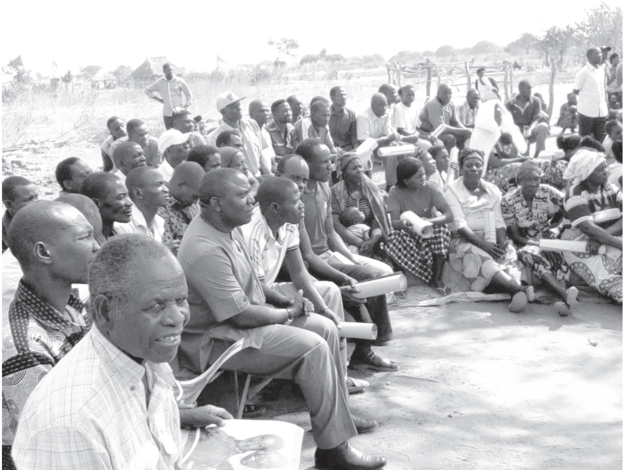
Former foreign affairs minister and 2021 presidential aspirant Harry Kalaba on a mobilisation tour in Shibuyunji District

“Once given a mandate by the Zambians to lead in 2021, we will ensure that we embrace all citizens regardless of tribe. One one people, and there is need for all of us to treat one another equally. The tast to bring together all Zambians lies on our shoulders,” he said. And commenting on the economic status of Shibuyunji, Kalaba said that district needed to receive equal economic development in terms of infrastructure development and proper support to the farmers, as agriculture remained the source of livelihood for people in the Central Province rural district. During the event, about 15 PF members reportedly defected from the ruling party and joined the Harry Kalaba movement. The state has blocked on a couple of occasions blocked Kalaba from registering a party on which to stand in 2021, but the former Cabinet minister has remained resolute that he will contest the next general elections