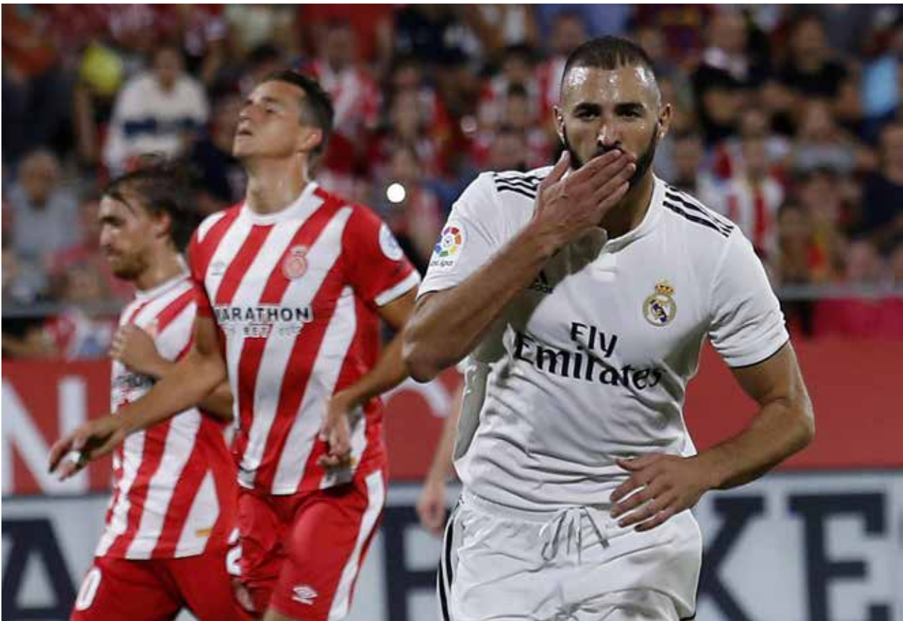
Real Madrid's Karim Benzema celebrates scoring a goal against Girona on Sunday, Madrid won 4-1