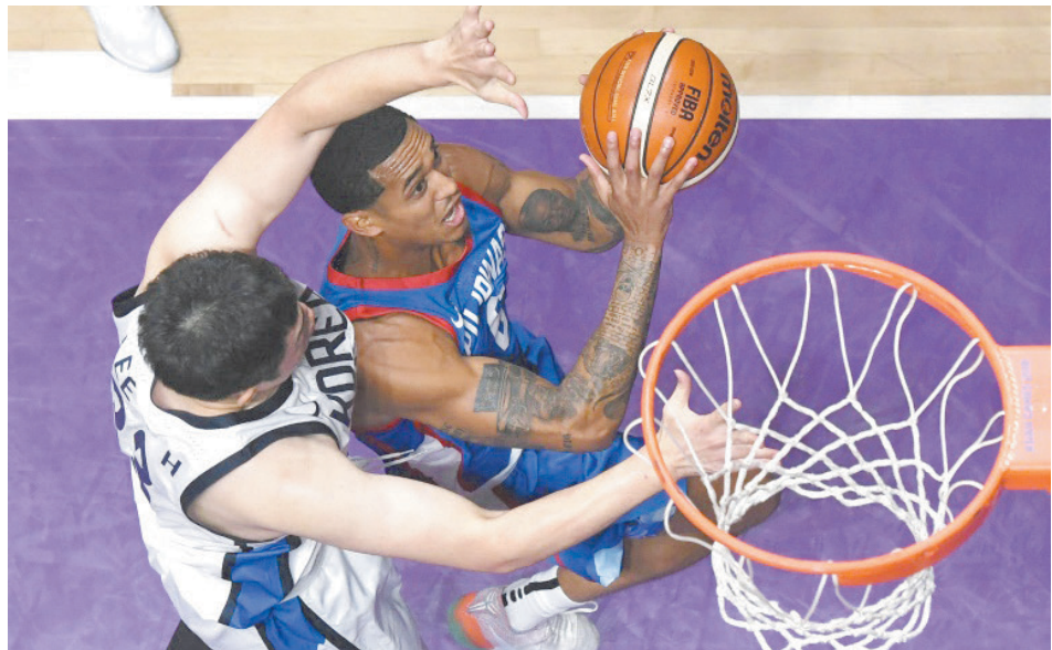
Cleveland Cavaliers guard Jordan Clarkson scored 25 points to keep the Philippines fighting, but South Korea took the game away in the final quarter.