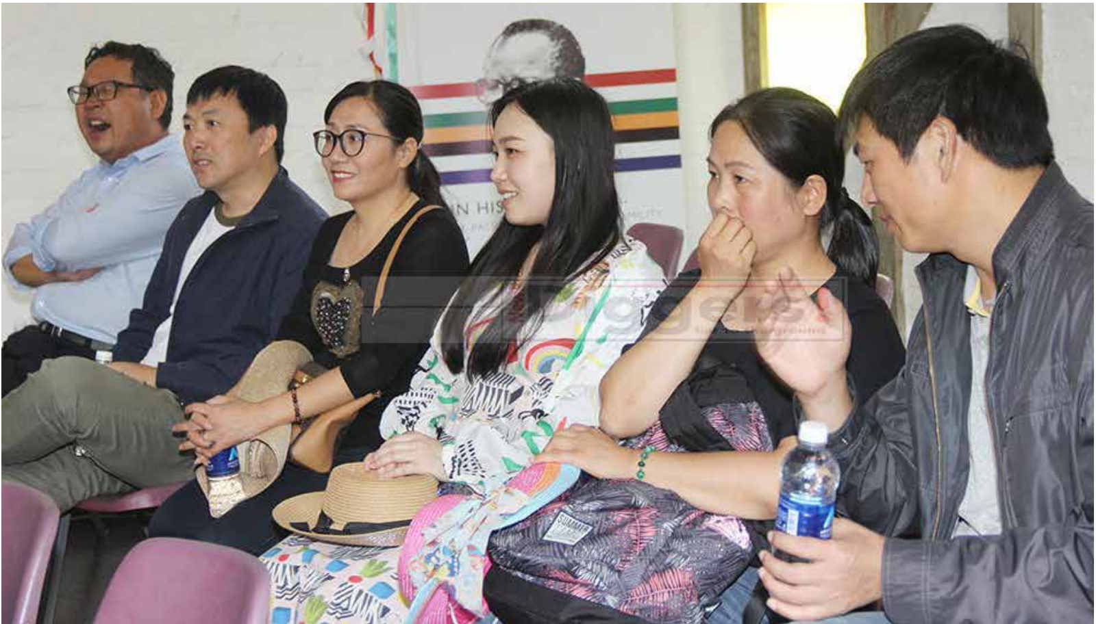
Chinese nationals at the Cathedral of the Holy Cross during senior Church leaders’ religious engagement under the theme ‘Prophetic agenda for national transformation’ yesterday

he saw what we were doing, and he went back and when he came back, he wanted to do business in Zambia. He picked on me that we should start up this beautiful business of MISSOIL. We looked around, my partner has a background of finance and I have a background of looking after customers at my little ‘Just Africa’, we started thinking of what could be done and we came up with making cooking oil because I was aware then that most of the cooking oil that we get is imported.” “So we realised that if we started growing Sun Flower, we were going to be the only ones who were going to do it. So that was how we got the seed from Zamseed and after we brought it to the community, that was when we planned and started this MISSOIL... we have created a market for the farmers around here because we buy the crop on their door step. We have also gone to Chipangali, Chiparamba were have shades and we have extension officers who we provide with motor bikes and they are here to witness this special event. We have about 2,000 farmers from whom we buy the Sun Flower and the little capacity we have in the plant, we are able to provide 2,000 litres of oil. So I am standing here to tell everyone that it doesn’t matter where you come from, you can do anything,” explained the MISSOIL representative.