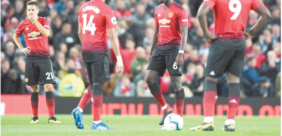
United have lost two of opening three PL games for first time since 1992 as Tottenham stunned Manchester United with a 3-0 win at Old Trafford on Monday Night.