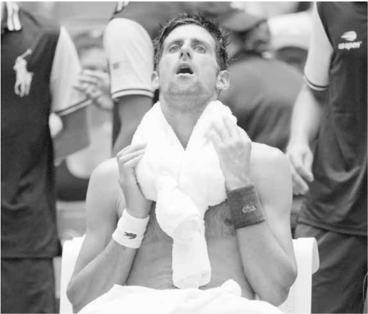
'Survival mode' sees Djokovic through at steamy US Open.