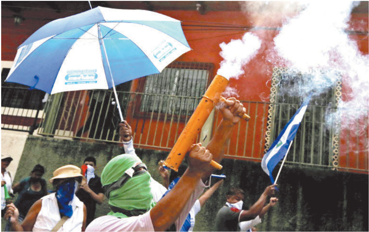
An anti-government protester fires a homemade mortar during a march dubbed "United Nicaragua will never be defeated" in Granada, Nicaragua

The United Nations called Wednesday for urgent action to prevent Nicaragua from descending further into turmoil after months of violent repression of protests against President Daniel Ortega's rule. In a fresh report, the UN human rights office detailed a wide range of serious violations, including disproportionate use of force by police, which in some cases resulted in extrajudicial killings, enforced disappearances, arbitrary detention and torture. "The violence and impunity of these past four months have exposed the fragility of the country's institutions and the rule of law," UN rights chief Zeid Ra'ad Al Hussein warned in a statement, describing a "climate of fear and mistrust". Nicaragua's descent into chaos was triggered on April 18 when relatively small protests against now-scrapped social security reforms were met with a government crackdown. Those demonstrations mushroomed into a popular uprising, with anti-government protesters facing off against police and paramilitaries supporting Ortega, whom critics accuse