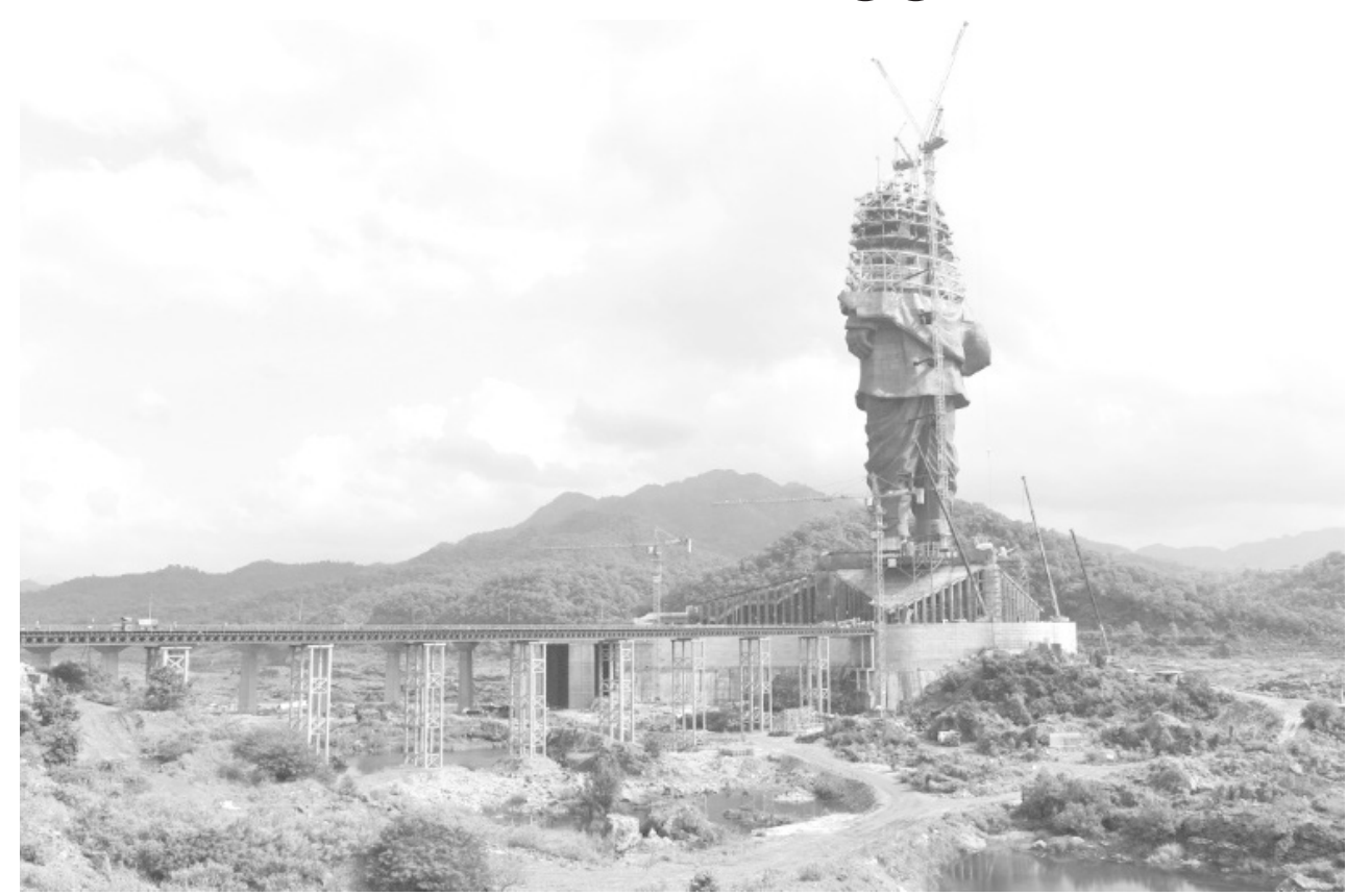
The statue of Sardar Vallabhbhai Patel in India's Gujarat state will stand 182 metres high when completed