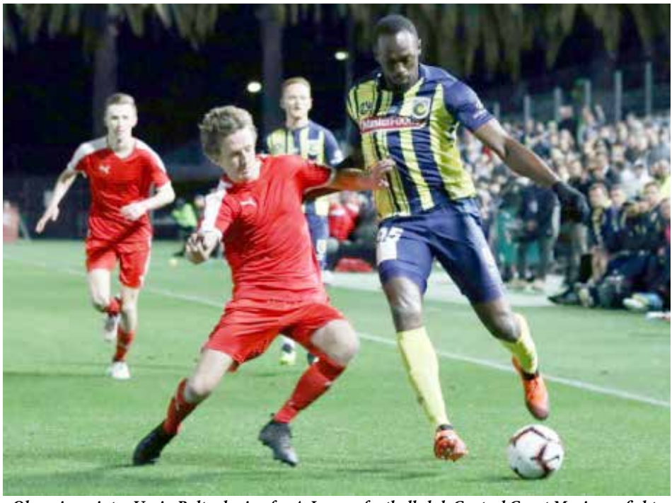
Olympic sprinter Usain Bolt, playing for A-League football club Central Coast Mariners, fights for the ball during a pre-season practice football match in Gosford, New South Wales.