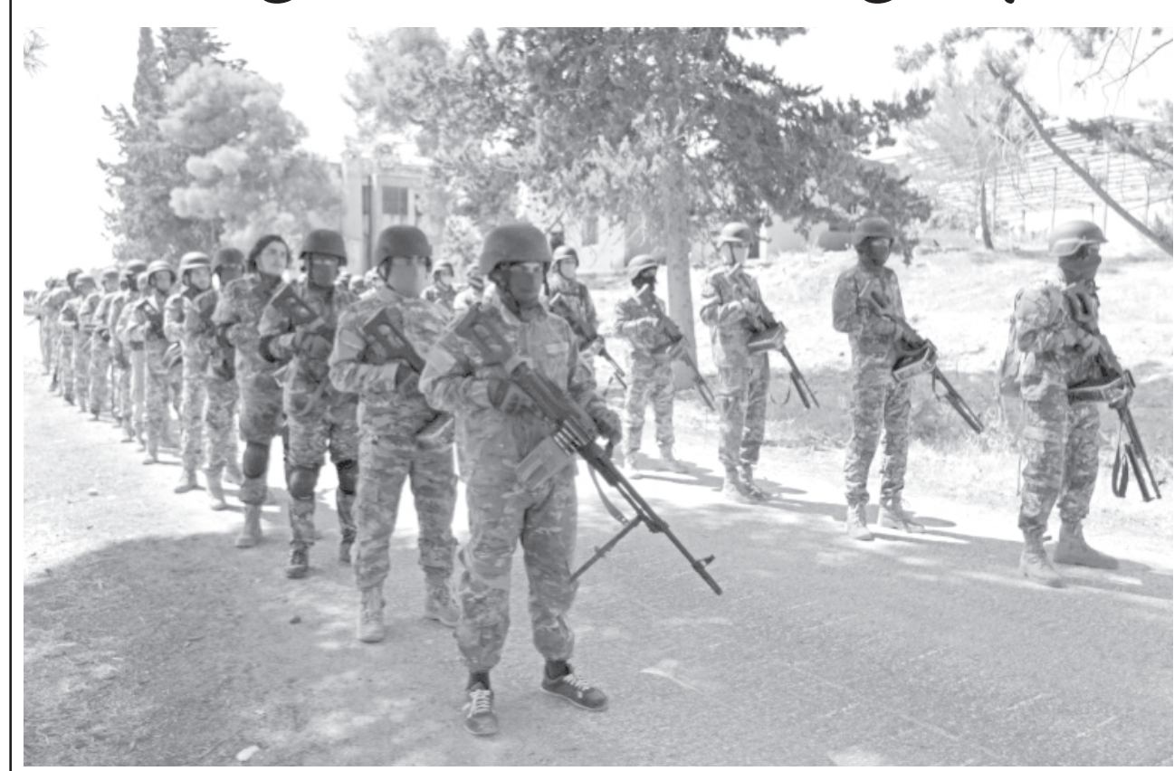
Syrian rebel fighters prepare for an upcoming government forces offensive, in the countryside of the rebel-held northern Idlib