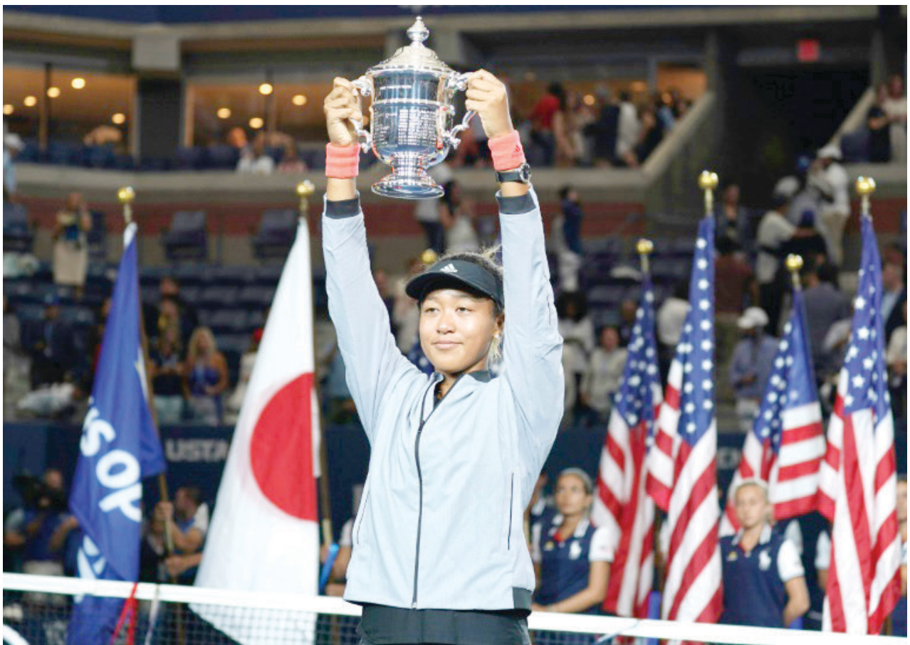
Naomi Osaka is the first Japanese to win a Grand Slam singles title.