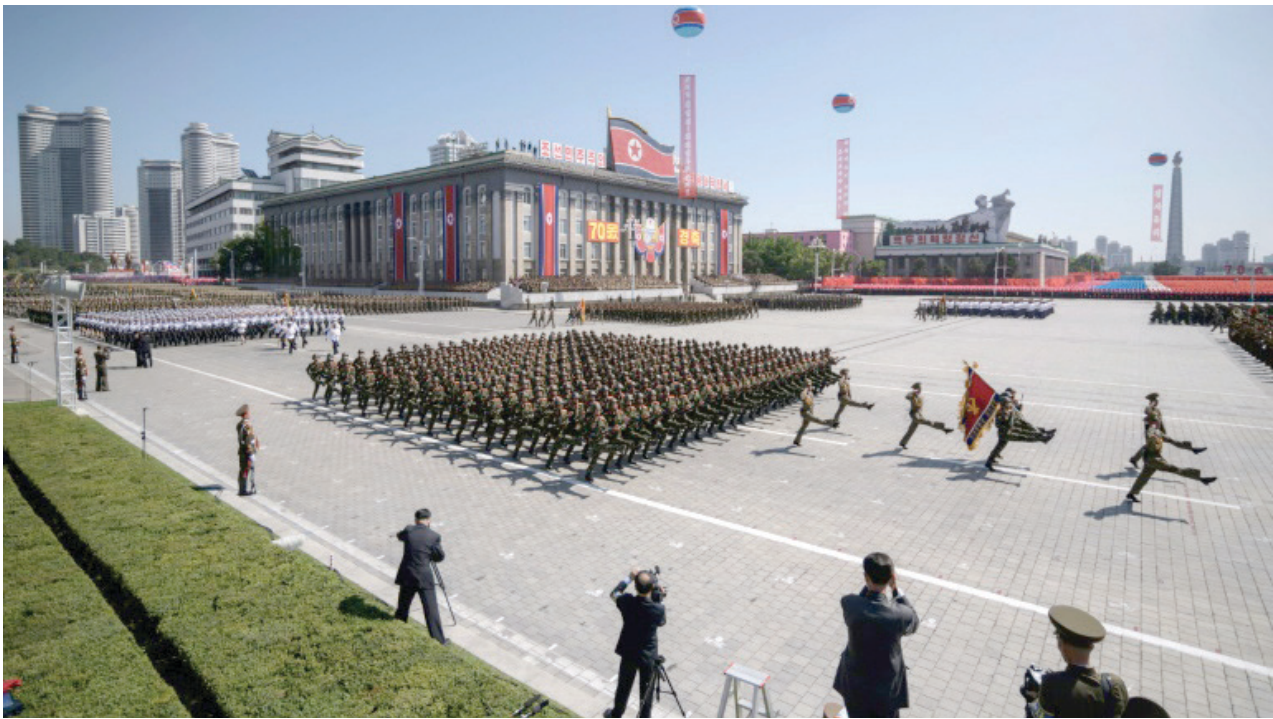
North Korea kept its nuclear missiles away from its 70th anniversary parade. AFP

fund to help developing nations react to our heating planet. The US and other developed economies want less oversight on how their funding is gathered and more flexibility over how future funding is structured. But developing nations insist they need predictable and open funding in order to effectively plan their fight against the fallout from climate change. A senior source within the African nations' negotiating bloc told AFP the US and others were renegeing on pledges made in Paris by refusing to discuss future climate funding. "It's as if we started from scratch" in Bangkok, the source said. The Bangkok talks were organised as an emergency negotiating session after little progress was made at previous rounds towards a final rulebook. Under the timeframe set in Paris, the guidelines for nations must be finalised by the COP 24 climate summit in Poland in December AFP