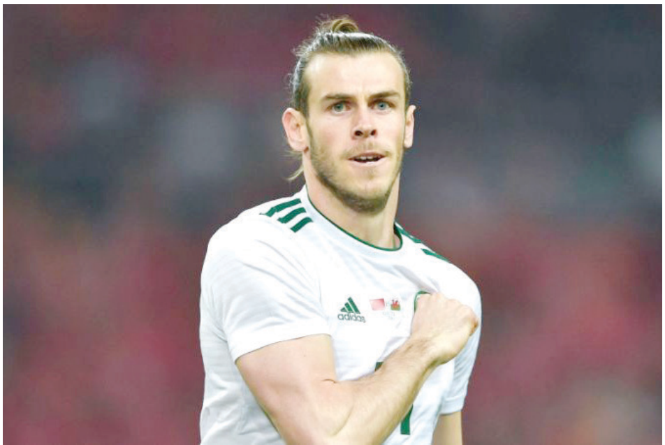
The winger will don the armband for the first time following 12 years' service to his national team, having made his debut at the age of 16.