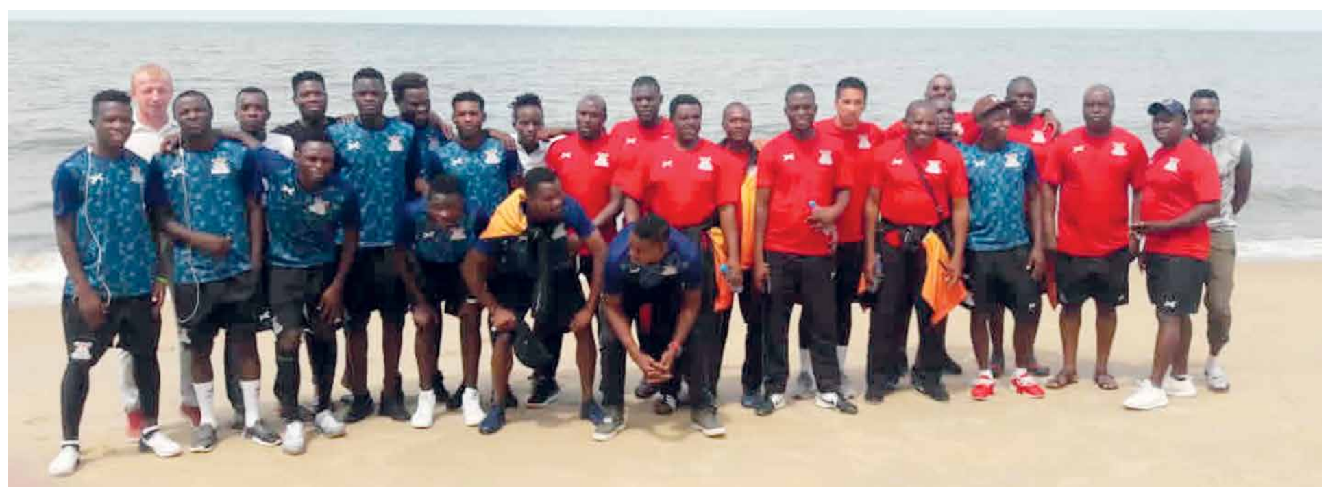
Chipolopolo squad at the Gabon disaster site a few minutes before taking to the airport. Zambia beat Gabon 1-0 in a friendly match on Tuesday