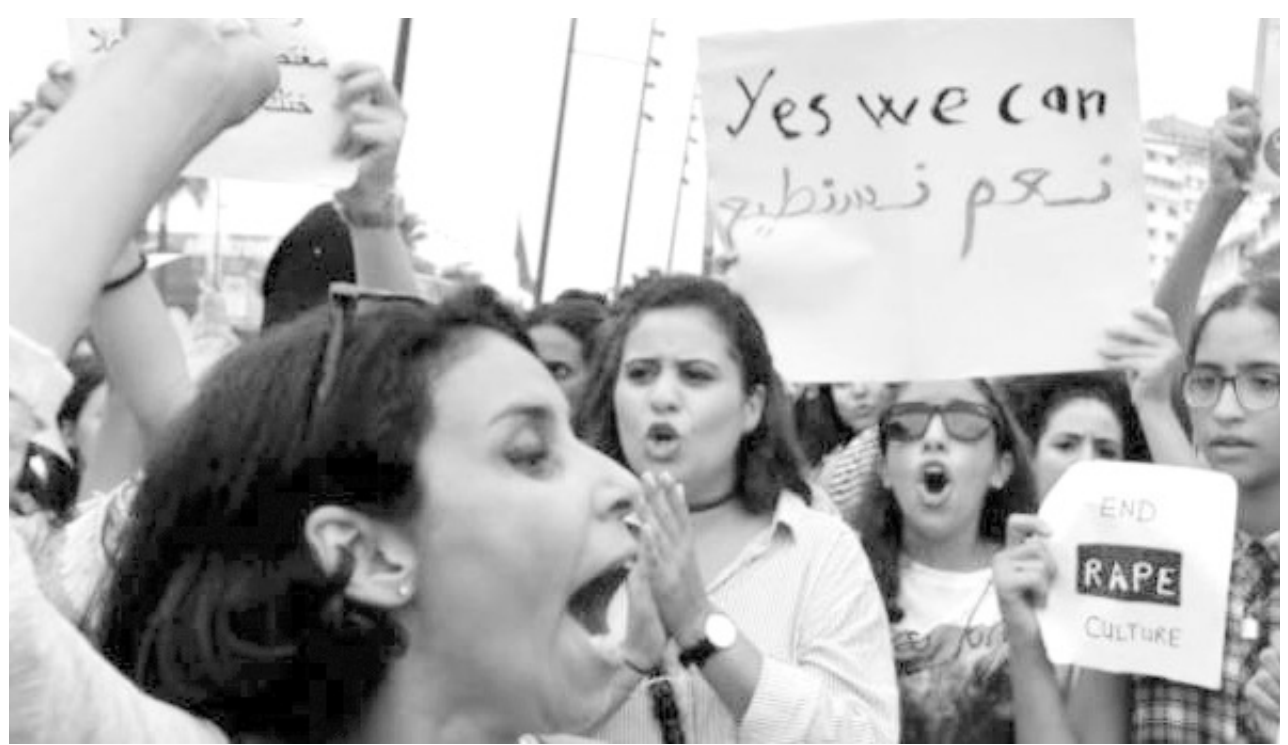
Women have campaigned for a law to criminalise sexual violence

BBC Arabic's Mouna Ba says the new law has been widely welcomed, but it has also been criticised because it does not provide a definition of domestic violence or a specific ban on marital rape. BBC