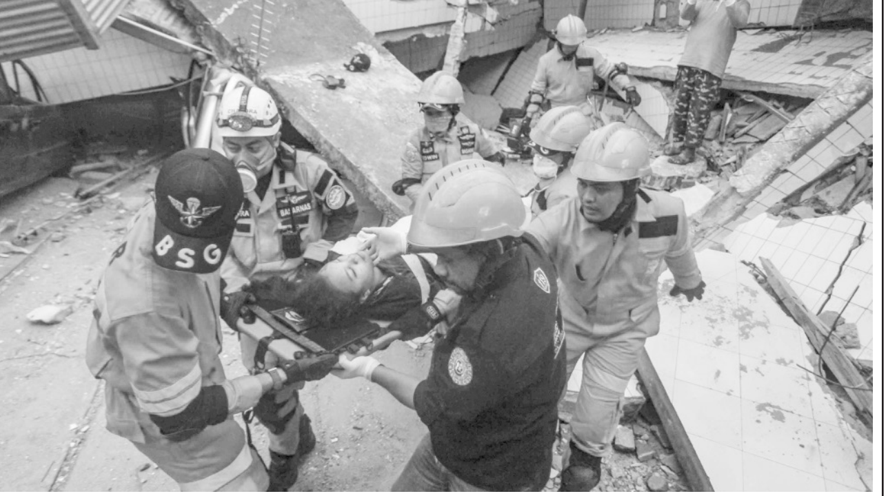
Search and rescue workers evacuate an earthquake and tsunami survivor trapped in a collapsed restaurant in Palu, Central Sulawesi

He said the court was an important deterrent to war crimes being committed in the world.