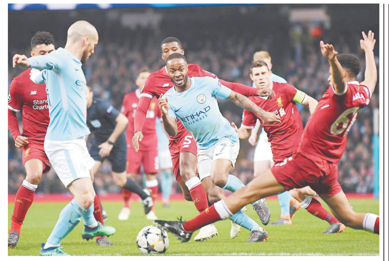
Premier League champions Manchester City reclaimed top spot in the table thanks to a goalless draw against title rivals Liverpool on Sunday.