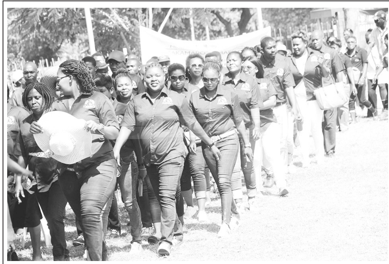
Teachers march as they commemorated this year's International Teacher Day under the theme: 'The right to education is the right to a qualified teacher' held at Lusaka's Civic Centre Nakatindi ground on Friday

detected and the candidates who were involved in those malpractices, their results will be revoked. Further, we also want to ensure that we change the legislation governing the examinations in this country," he said. "And one of the things that