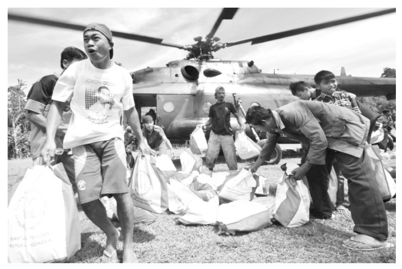
Indonesian army choppers are running missions to deliver supplies to remote parts of the region. AFP

Medical teams have not villages, despite more than from Anutapura Hospital in even reached some of a week lapsing since the the hardest-hit far-flung quake. AFP