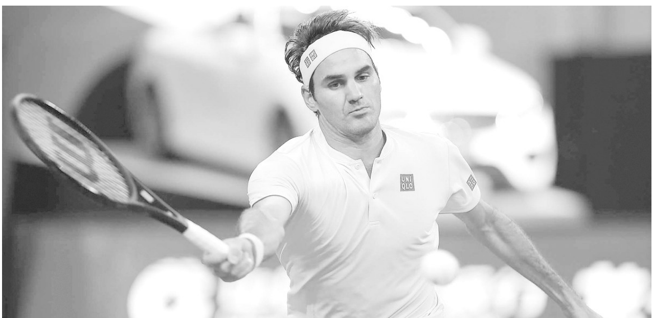
Roger Federer defeats Daniil Medvedev 6-4, 4-6, 6-4 in a thrilling second-round encounter at the Rolex Shanghai Masters.