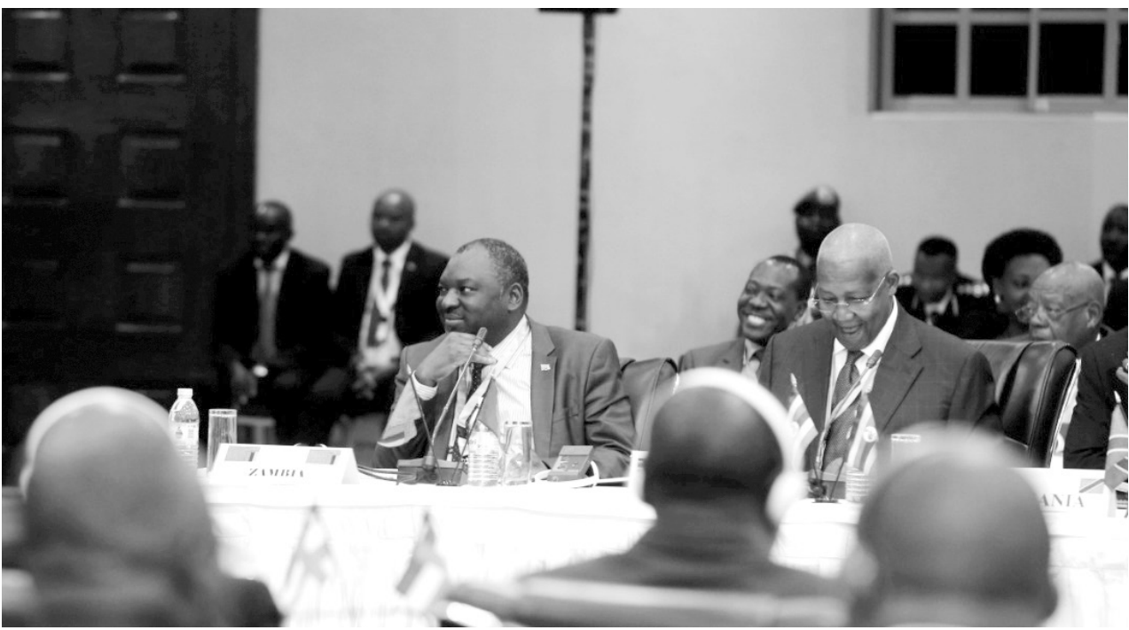
Zambia's Defence Minister Davies Chama ,Uganda's Foreign Affairs Minister Sam Kutesa and other delegates laugh during the 9th High level Conference of the regional oversight mechanism of the Peace, Security and Cooperation framework for the Democratic Republic of Congo and the Great Lakes Region at Speke Munyonyo Resort Hotel in Kampala, Uganda on Monday