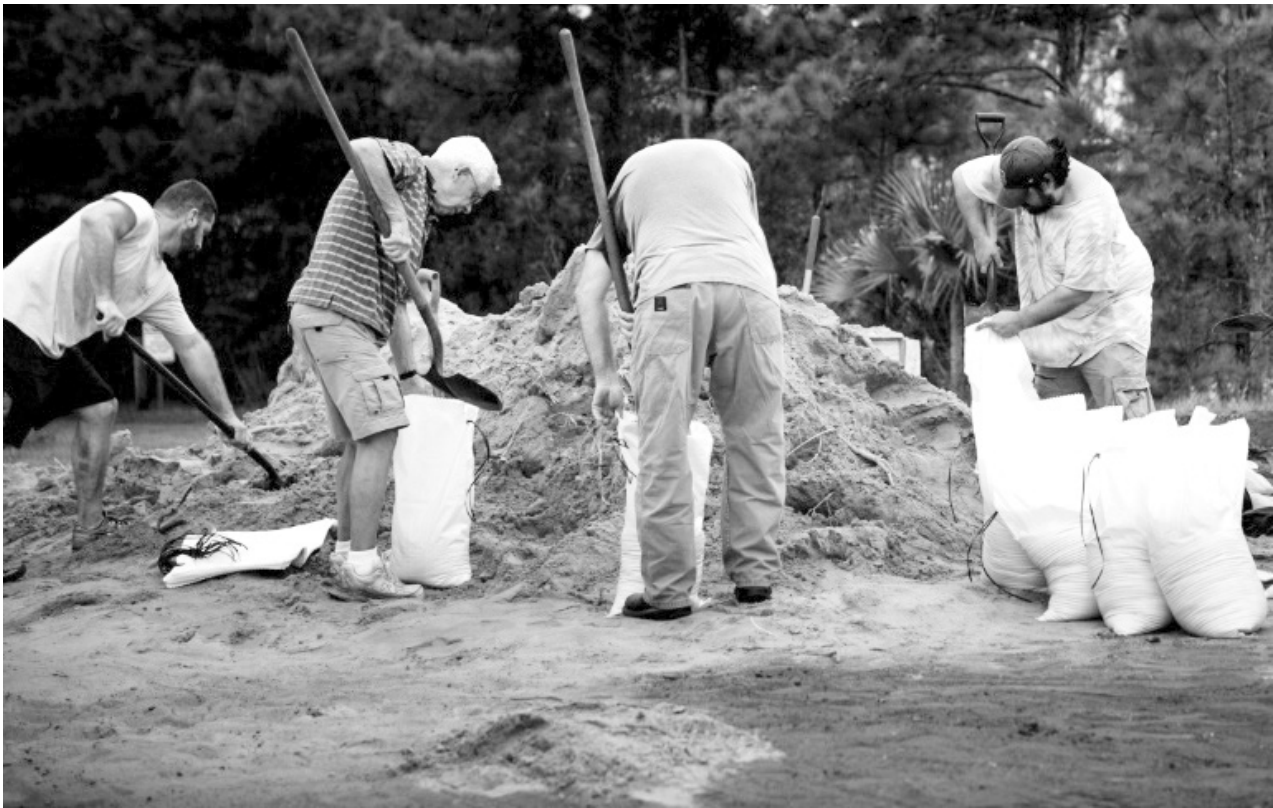
People fill bags with sand at the Lynn Haven Sports Complex while preparing for major Category 3 Hurricane Michael in Panama City, Florida.

The case documents "meticulously designed plot" to assassinate Hasina hatched by the BNP. The BNP and Jamaat-e-Islami coalition government, which was in power at the time of the attack, was accused of scuttling the investigation to protect the masterminds.