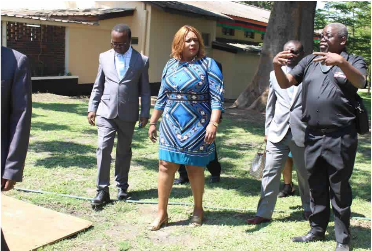
Information and Broadcasting Services Minister Dora Siliya tours the Talent Factory Academy for Southern Africa at ZAMCOM institute in Lusaka yesterday

"Transparency International Zambia, would like to urge government to come up with a lasting solution to the perennial problems faced by the two largest public universities. The problems at UNZA and the Copperbelt University, are well catalogued but what is in short supply are bold tangible decisions to redress the situation at hand. Poor funding to these two institutions and erratic release of funds for student related allowances, has always been a driver of student unrest. It is time that, through joint effort, a more enduring solution is found. We cannot continue losing young lives simply because successive governments have failed to find the right solutions for the challenges at hand."