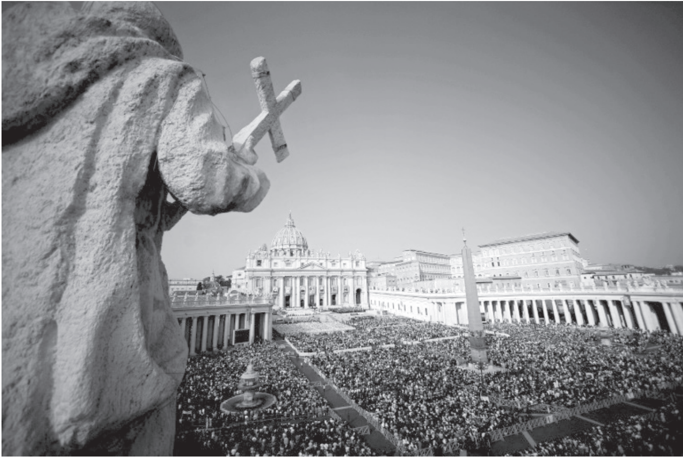
St Peter's Square at the Vatican was packed for the canonization of Archbishop Oscar Romero, Pope Paul VI and five other new saints.

point on Sunday, wiping out their gains for 2018. British billionaire Richard Branson and Uber CEO Dara Khosrowshahi, as well as media powerhouses like Bloomberg and CNN, have pulled out of next week's Future Investment Initiative (FII) in Riyadh, dubbed "Davos in the desert".