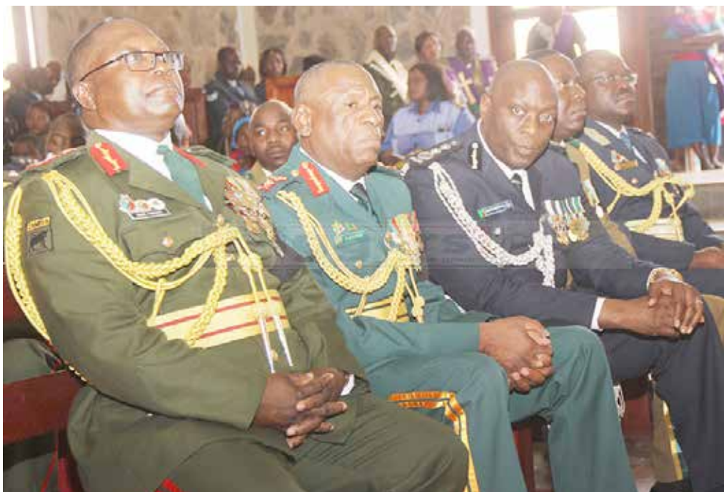
Defense and Security Service Chiefs at the requiem mass for the Zambians who died in a road traffic accident in South Africa at the Cathedral of the Child Jesus on September 25, 2018