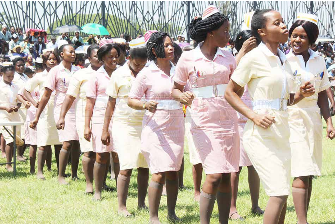
Dovecot College of Nursing students sing at the Zambia Association of Private Nursing College 2nd graduation ceremony at Woodlands Stadium in Lusaka on October 12, 2018