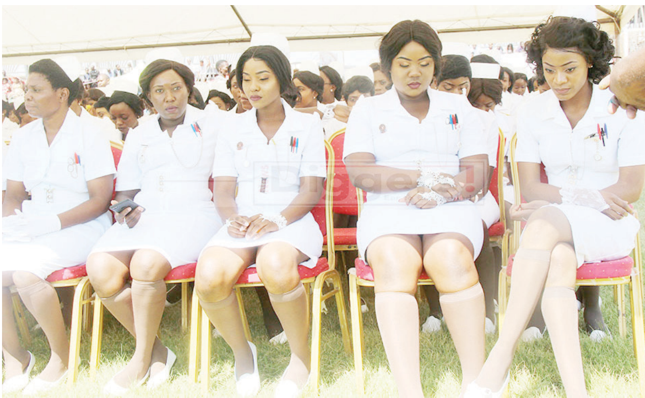
Graduants at the Makeni College of Nursing attend the Zambia Association of Private Nursing Colleges 2nd graduation ceremony at Woodlands Stadium in Lusaka

Sata left Lungu to act because he was the only drunkard without ambitions - CK