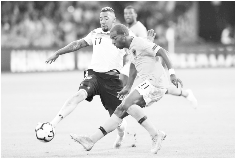
Germany defender Jerome Boateng is out of Tuesday's match against France after injuring his calf in the 3-0 defeat to the Netherlands.

themselves last in their Nations League pool. The Germans must win their last two games, against the French on Tuesday and Dutch in Gelsenkirchen on November 19, or risk relegation in the competition's debut.