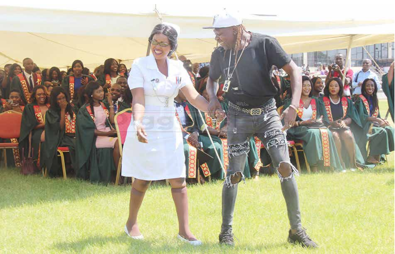
An Amayengi dancer invites a graduating nurse from Makeni College of Nursing to the dancing arena during the Zambia Association of Private Nursing College 2nd graduation ceremony on Friday