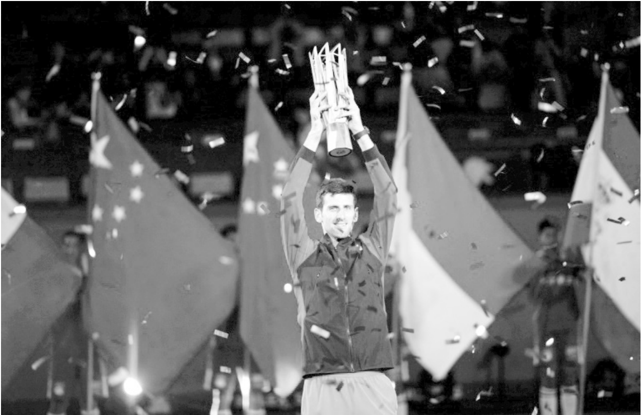
Novak Djokovic of Serbia poses with his trophy after beating Borna Coric of Croatia in the Shanghai Masters

Red-hot Djokovic has now been victorious in 18 ATP matches in a row and in recent months won Wimbledon, the Cincinnati Masters, the US Open and now Shanghai for a fourth time. It is all a far cry from just five months ago, when Djokovic fell to 22nd in the world as he struggled following elbow surgery in February. He missed the second half of 2017 with elbow and off-court issues, but said he had adapted his game since the operation. Djokovic, who has been particularly dominant on his serve, not dropping one service game in Shanghai, said: "I think you're seeing the new Novak." "I don't need to describe him, that's all I can say." "I had to reinvent myself and find, you know, (a) proper formula for success." "I found it and I'm just trying to hold on to it as long as I can." Asked by AFP if he had a message for the under-pressure Nadal, the Serb smiled: "I will leave that up to your creative spirit of journalism." The 32-year-old Nadal could return from his latest injury for the Paris Masters, which starts at the end of this month. Djokovic said he could play Vienna or Basel, the week before Paris, in an effort to further rein in his rankings rival. The 21-year-old Coric said that he had no complaints about losing to "one of the best in the history of tennis". In what was the biggest match of his life, he wore heavy strapping on one thigh and has been troubled by a stiff neck that saw him ponder pulling out before the tournament. AFP