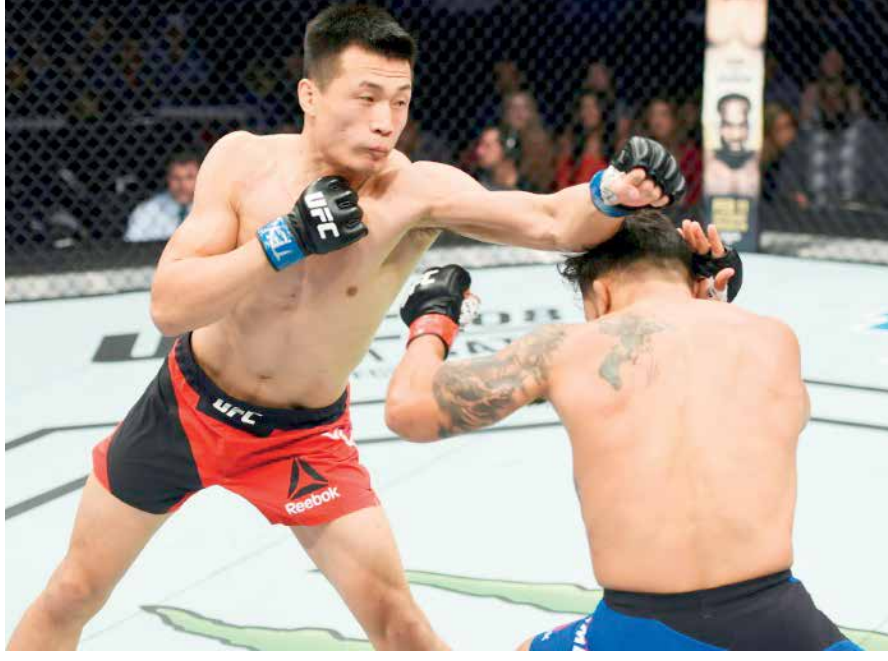
Chan Sung-jung says MMA can have a positive impact