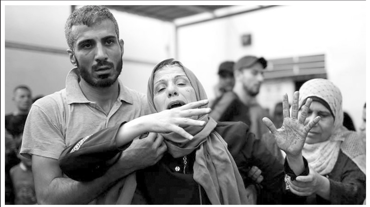
Mother crying after losing a child who was killed by the Israeli air strike at the hospital in Gaza early on Wednesday.

most unpopular Brazilian presidents in decades. He has a five percent approval rating.