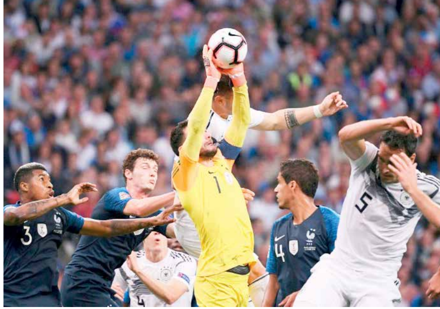
France goalkeeper Hugo Lloris (C) comes to the rescue in a 2-1 Nations League win over Germany he put down to their 'mental strength'