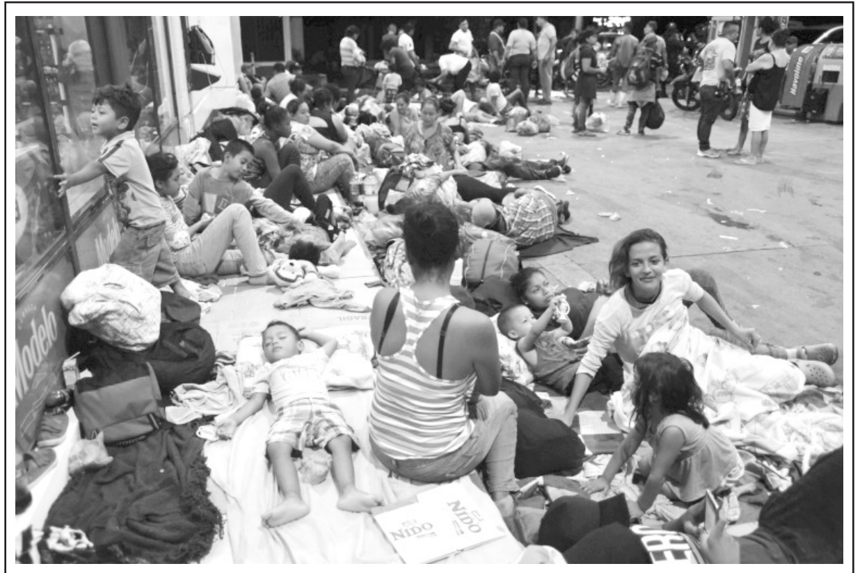
The migrants, forming what is known as "a caravan," set out Saturday from impoverished, violence-plagued Honduras and were headed north on the long journey through Guatemala and Mexico to the US border.

above all else without regard to other positive developments is a dangerous attempt that will face utter failure," he warned in the letter obtained by.