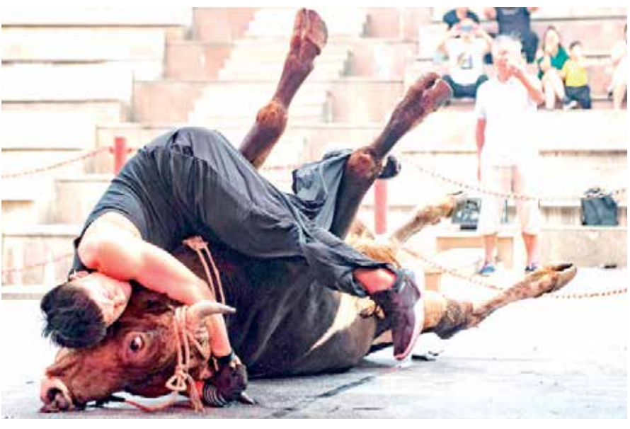
Bull wrestling has come under fire from critics in China who say it constitutes animal cruelty

Home of investigative journalism in Zambia