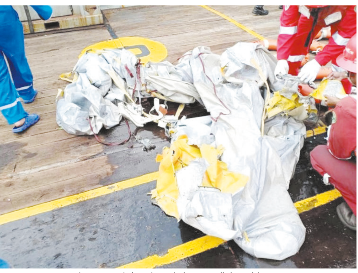
Debris apparently from the crashed jet was pulled out of the water

Indonesia's National Transportation Safety Committee (NTSC) said there were 178 adult passengers, one child, two