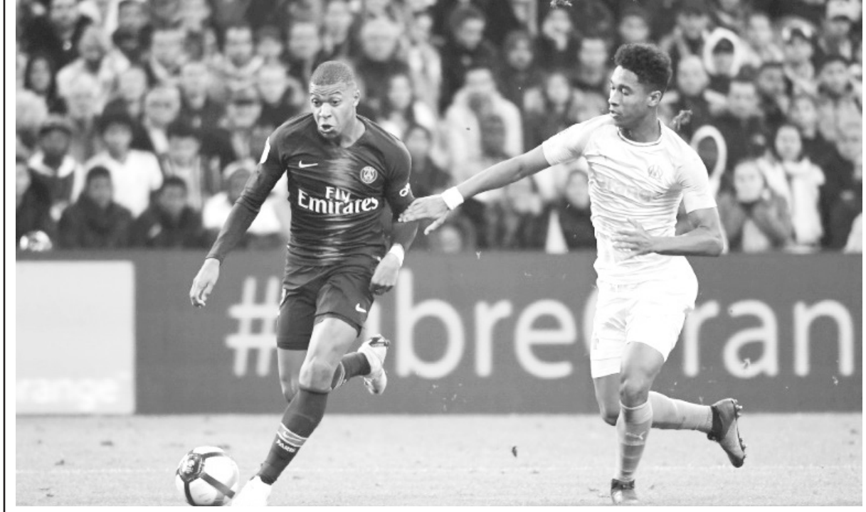
Kylian Mbappe burst away from Boubacar Kamara, coming off the bench and scoring the opener as Paris Saint-Germain won 2-0 at Marseille on Sunday to make it 11 wins out of 11 in Ligue 1 this season and match a longstanding European record.

get someone who can score as many goals as possible." SUPERSPORT