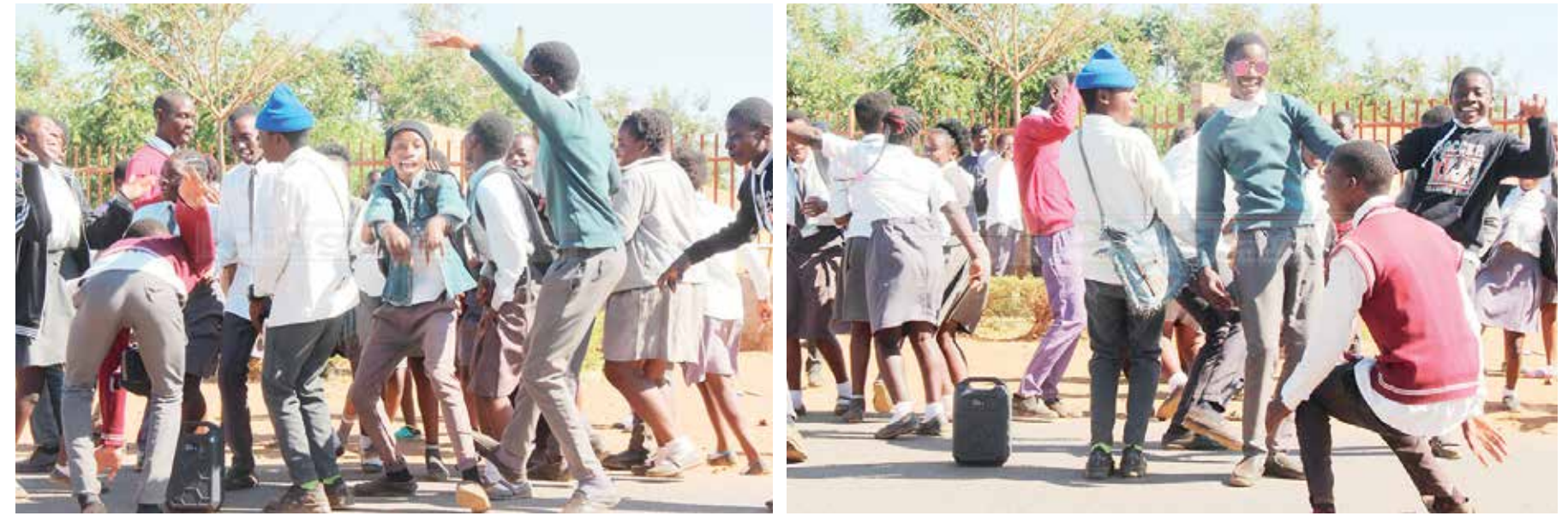
Lusaka's Nyumba Yanga Primary School pupils took to the street to riot over the suspended grade 7, 9 and 12 examinations. The Pupils almost blocked Alex Chola Road as they chanted 'Give us our exams' slogan yesterday