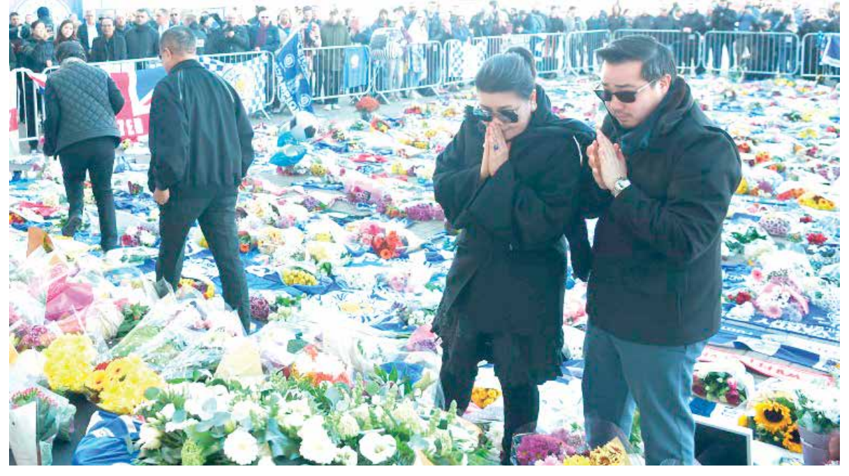
Family, players pay tribute to Leicester City owner

"The president looked at me in a way that suggested I was no longer indispensable, if you know what I mean. That is what made me think about leaving." AFP