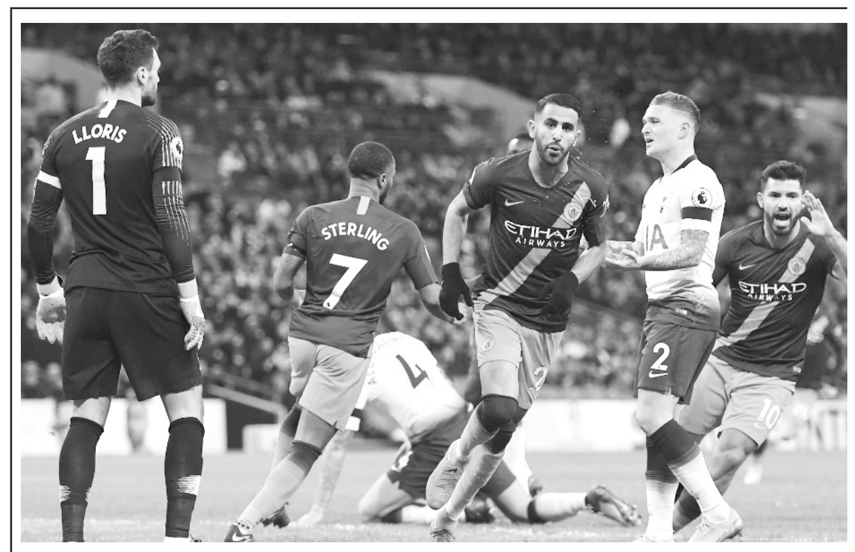
Riyad Mahrez celebrates after scoring the opening goal taking Manchester City back to the top of the Premier League as the champions won 1-0 in their pitch battle with Tottenham at Wembley stadium in London, England, Monday, Oct. 29, 2018.

under his leadership," he told AFP. "The increase in sponsorship reflects his credibility and he is transparent in his job."