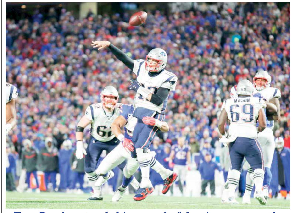
Tom Brady extends his record of dominance over the Buffalo Bills as the New England Patriots run out 25-6 winners to tighten their grip on the AFC East