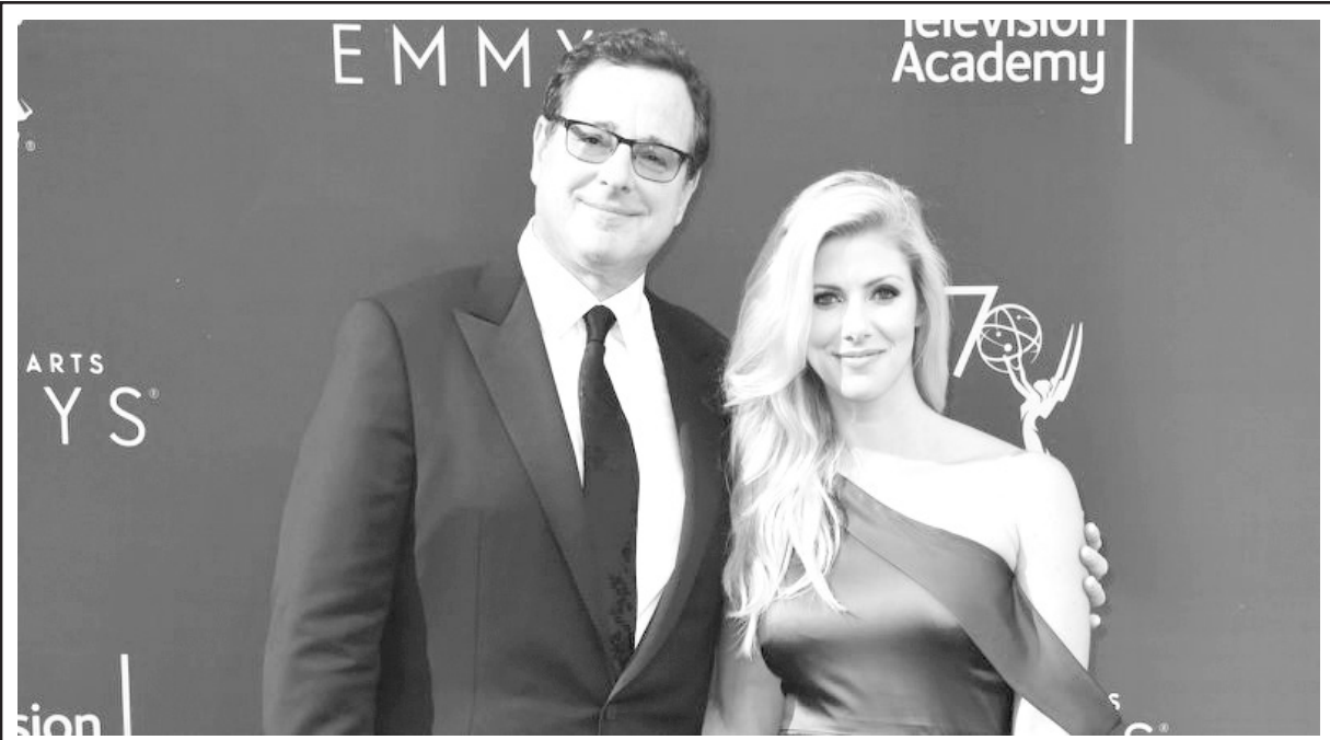
The 'Full House' star shared a sweet shot with his bride on Monday to announce that the pair "went and did it."

" 'Cause I've never met anyone like you, and I knew if I wasn't with you, I'd be searching in vain for the rest of my life."