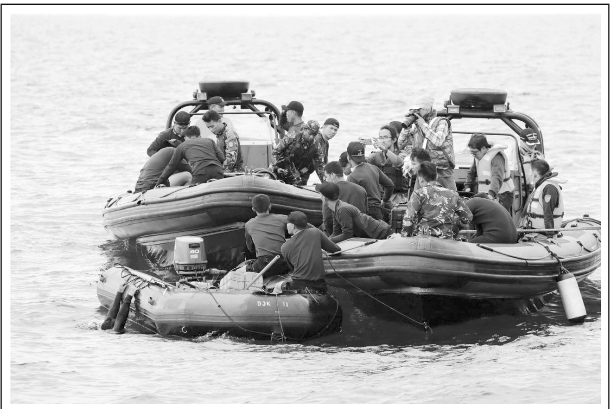
Rescue team members prepare to dive at the location where Lion Air flight JT610 crashed into the sea, in the north coast of Karawang regency, West Java province Indonesia, October 30, 2018.

Hoegel appears to have followed a similar procedure each time, first injecting a medication that triggered cardiac arrest, followed by an often futile attempt at