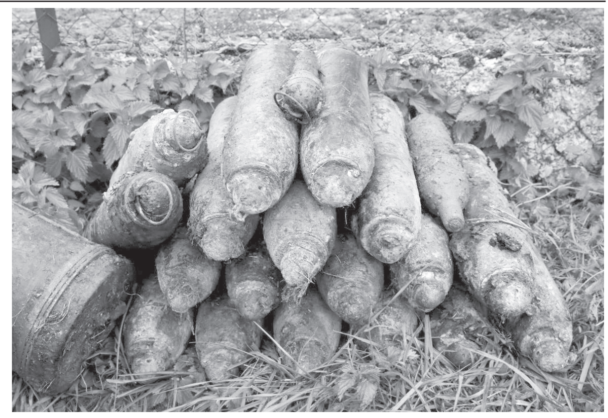
Unexploded shells recovered in the Meuse River are seen on the bank at Sivry-sur-Meuse, close to WWI battlefields, near Verdun, France, October 24, 2018 before the centenial commemoration of the First World War Armistice Day.

The IMN has held a series of protests in Abuja over the past year to demand the release of its leader Ibrahim Zakzaky. He has been in government custody since fighting between his supporters and the army broke out in December 2015.. BBC