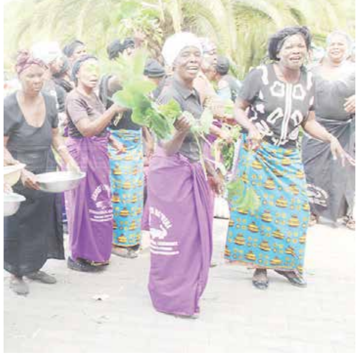
Ukusefya pa Ng'wena choir of the Bemba speaking people sing at the funeral