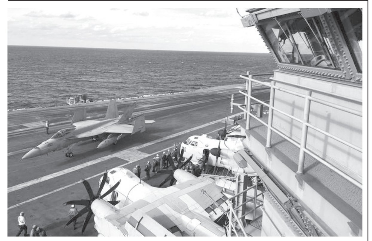
U.S. Navy aircraft carrier USS Ronald Reagan conducts military drills during Keen Sword, a joint field-training exercise involving U.S. military, Japan Maritime Self-Defense Force personnel and Royal Canadian Navy, at sea November 3, 2018.

body bags, few containing intact remains, had been recovered and handed to police for forensic identification, yet only seven victims had been identified. "I'm sure the total will