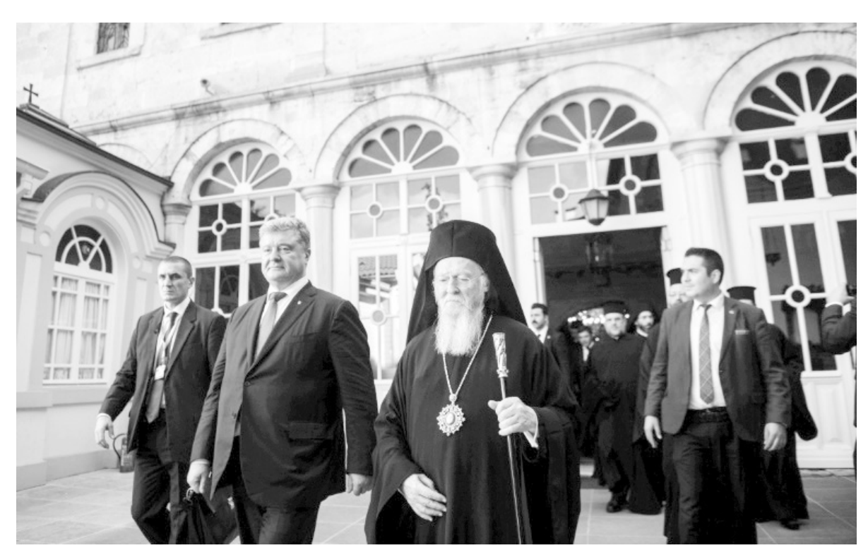
Ukraine's president Petro Poroshenko (L) leaves the Fener Greek Patriarchate after meet Ecumenical Patriarch of Constantinople Bartholomew (R

Ecumenical Patriarch Bartholomew I had on October 11 agreed to recognise the independence of the Ukrainian Orthodox Church from the Moscow Patriarchate, a move that was welcomed with jubilation by Kiev but condemned as "catastrophic" in Moscow. On a visit to Istanbul that will see him hold talks with Turkish President Recep Tayyip Erdogan, Poroshenko signed an agreement setting out the steps needed to formalise the recognition of the independence of the Ukrainian Church, known as Tomos.