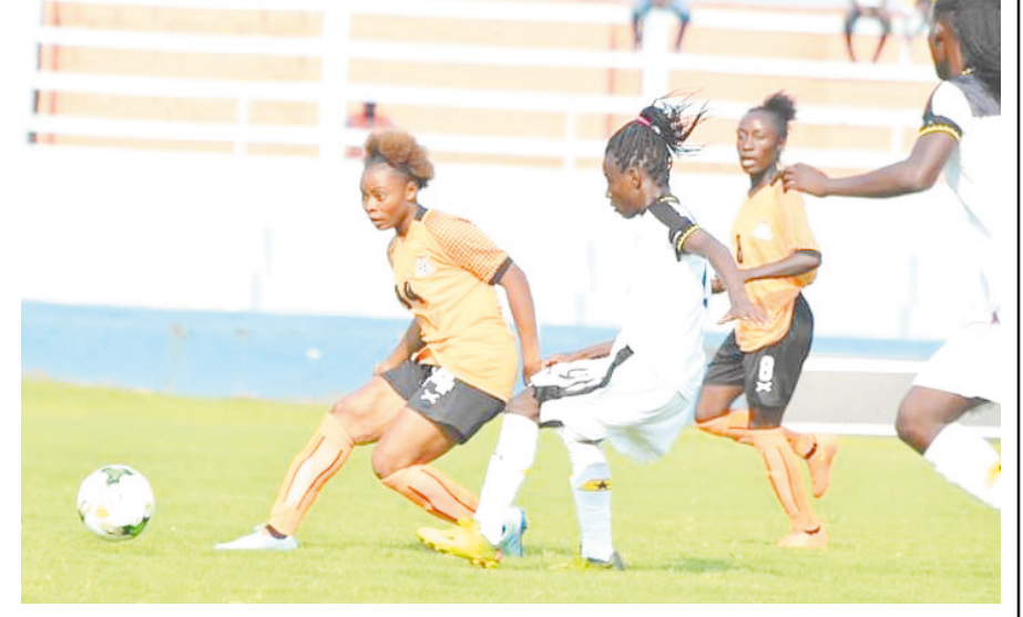
Shepolopolo and Black Queens of Ghana in football action at Nkoloma stadium during the friendly match on Saturday

be instrumental in the side's CAF champions league campaign.