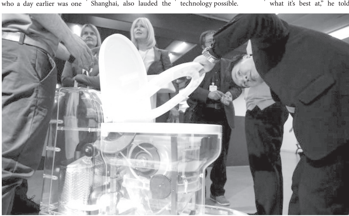
A man looks at a toilet design by Cranfield University at the Reinvented Toilet Expo showcasing sewerless sanitation technology in Beijing, China November 6, 2018.

"In the way that a personal computer is sort of self contained, not a gigantic thing, we can do this chemical processing at the household level," he said. REUTERS