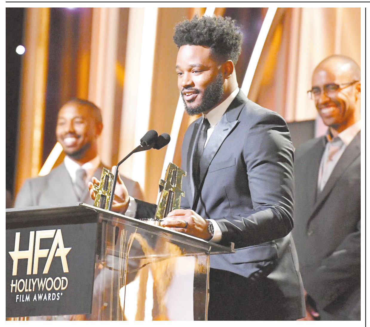
Ryan Coogler accepts the Hollywood Film Award for 'Black Panther' onstage during the 22nd Annual Hollywood Film Awards at The Beverly Hilton Hotel on November 4, 2018 in Beverly Hills, California.