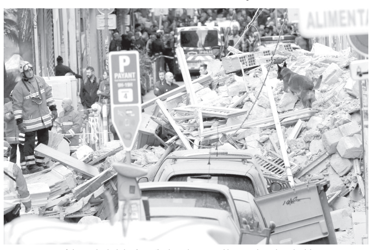
Firefighters take the help of a sniffer dog to locate possible trapped people in the debris

just before the explosion," Nacer manager of a shop across the street.