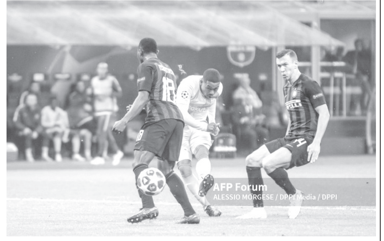
Malcom of FC Barcelona scores a goal during the UEFA Champions League Group B match between FC Internazionale and FC Barcelona on Tuesday at San Siro stadium in Milan, Italy

who is one of Italy's most successful swimmers and once raced against two dolphins.