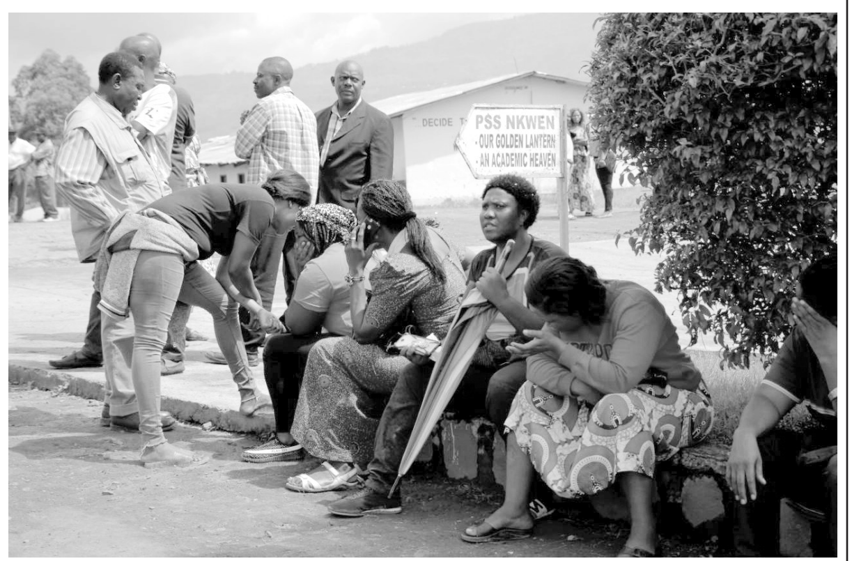
Parents await for news of their children at a school where 79 pupils were kidnapped in Bamenda, Cameroon November 6, 2018.

to retain the YPG as a key partner in its battle against a resilient Islamic State group.