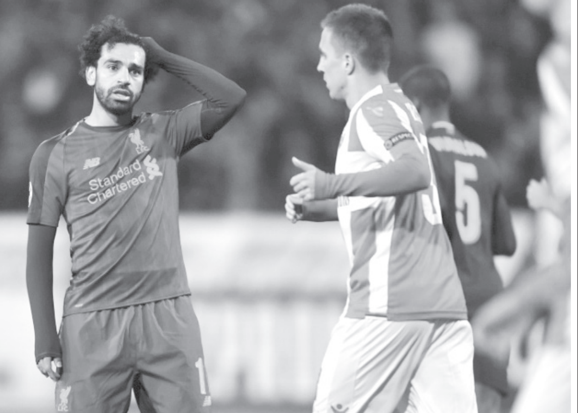
Head-scratcher: Mohamed Salah (left) failed to fire as Liverpool suffered a shock 2-0 defeat to Red Star Belgrade.

Manchester United frontman is just expected to make a brief cameo as a substitute at the home of football.