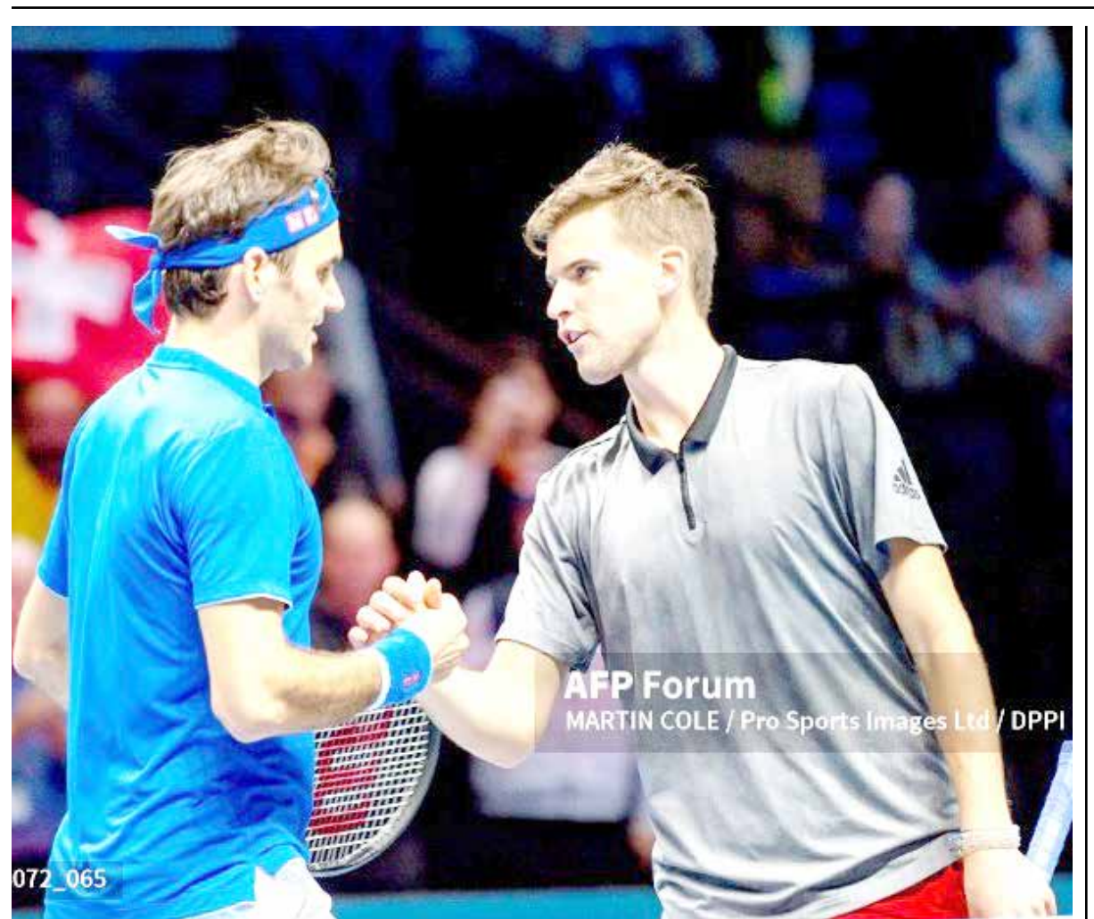
Roger Federer of Switzerland shakes hands with Dominic Thiem of Austria after winning his match during the Nitto ATP World Tour Finals at the O2 Arena, London, United Kingdom on November 13, 2018.