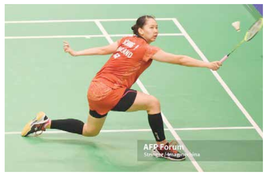
Pornpawee Chochuwong of Thailand returns a shot to Chen Yufei of China in their first round match of women's singles during the YONEX-SUNRISE Hong Kong Open 2018 badminton championship in Hong Kong, China, 14 November 2018.