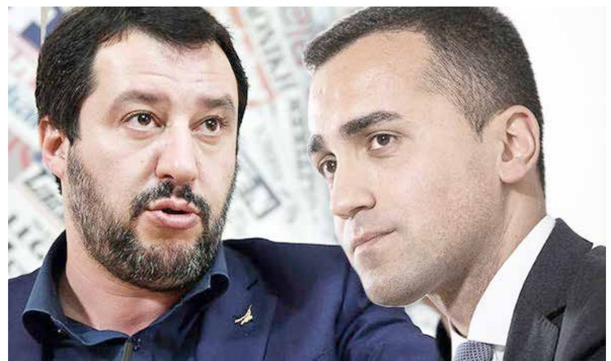
Italy's co-Deputy Prime Ministers Luigi Di Maio (r) and Matteo Salvini made defiant comments