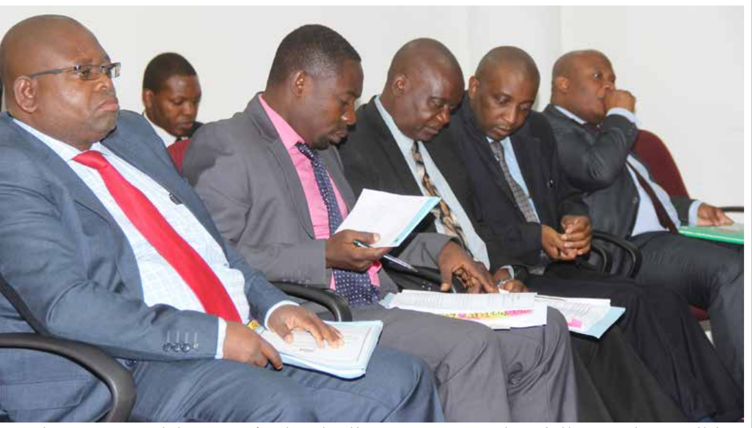
Southern Province provincial administration officers during the Public Accounts Committee at Parliament building

"In order to ensure orderly management of public affairs, it is the duty of permanent secretaries to guide their ministers on the operations of the law. The system of government depends on observing the law and the regulations without which only chaos would prevail."