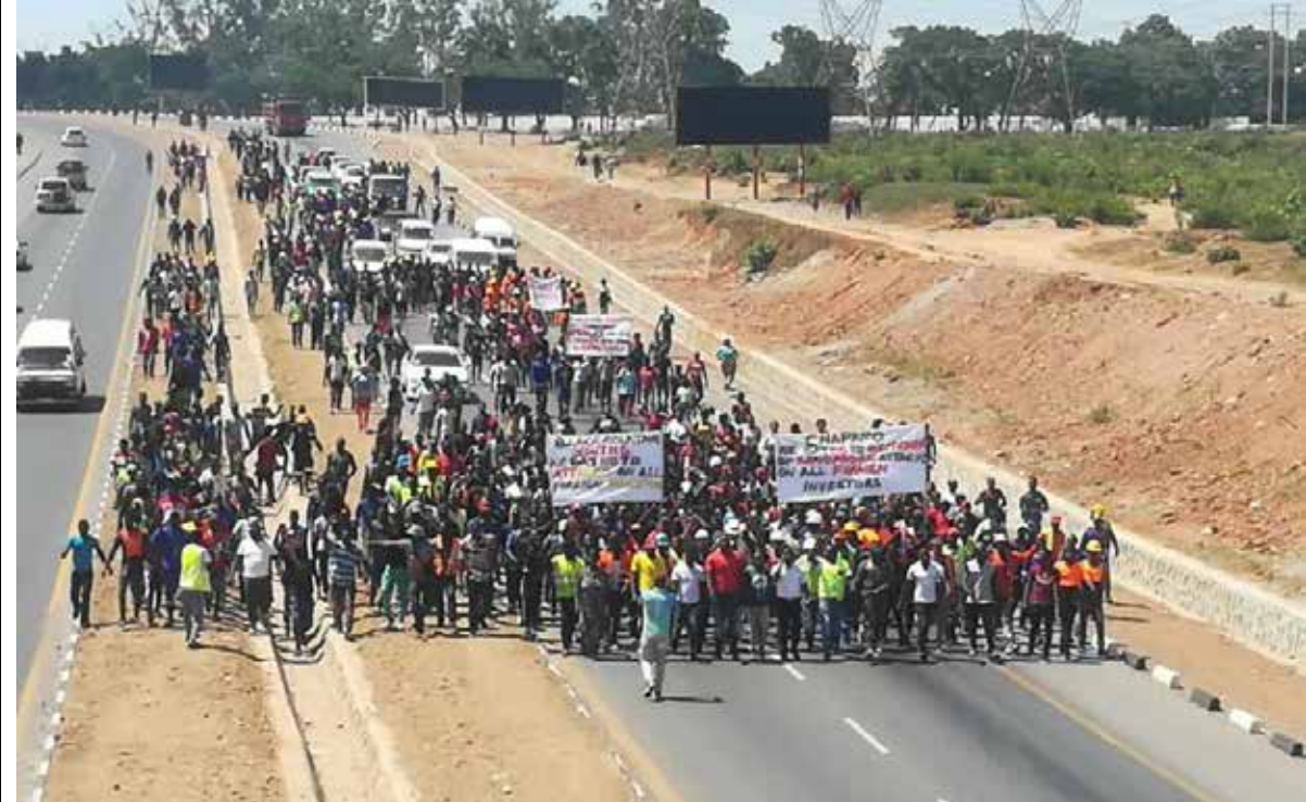
Ndola PF youths protest against 'xenophobia' yesterday