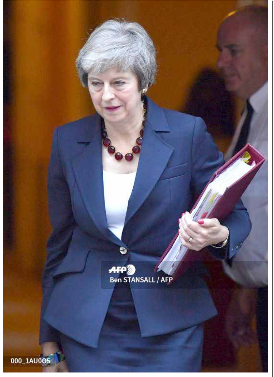
Britain's Prime Minister Theresa May leaves 10 Downing Street in London on November 14, 2018, to attend the weekly Prime Minister's Questions at the Houses of Parliamnet. British and European Union negotiators have reached a draft agreement on Brexit, Prime Minister Theresa May's office said on November 13.