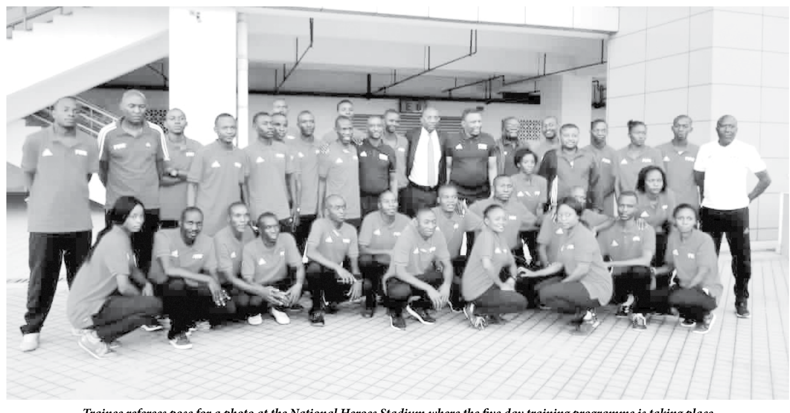
Trainee referees pose for a photo at the National Heroes Stadium where the five day training programme is taking place

"If you do not invest in the pillars of refereeing as well as coaching and the players, then there will be no football. I think this [is] why you tend to see that