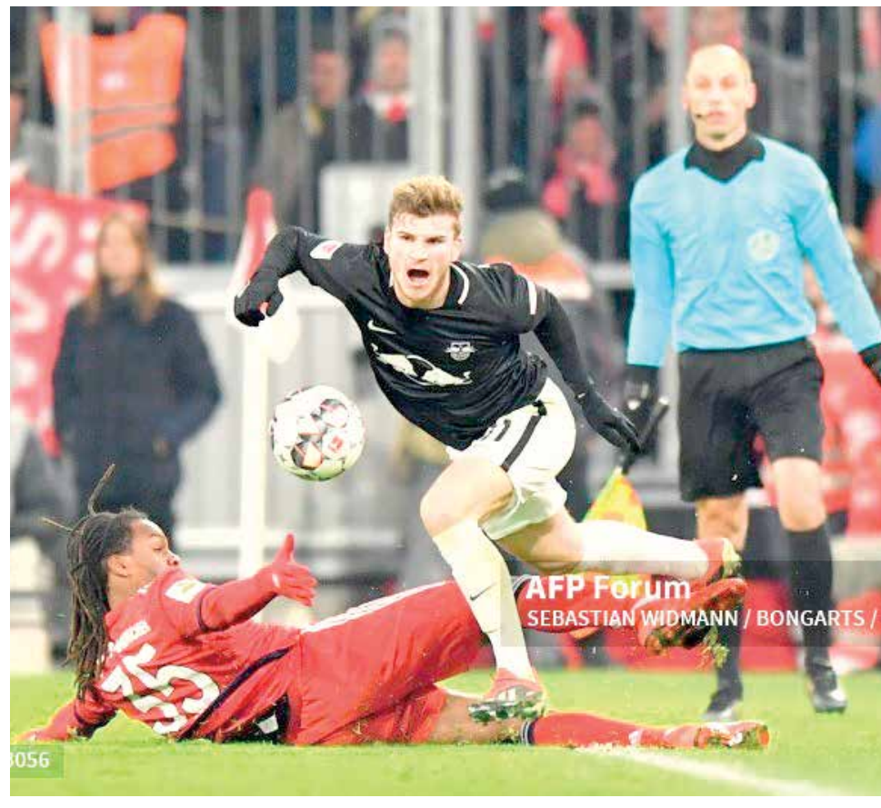
Timo Werner of RB Leipzig is fouled by Renato Sanches of Bayern Munich