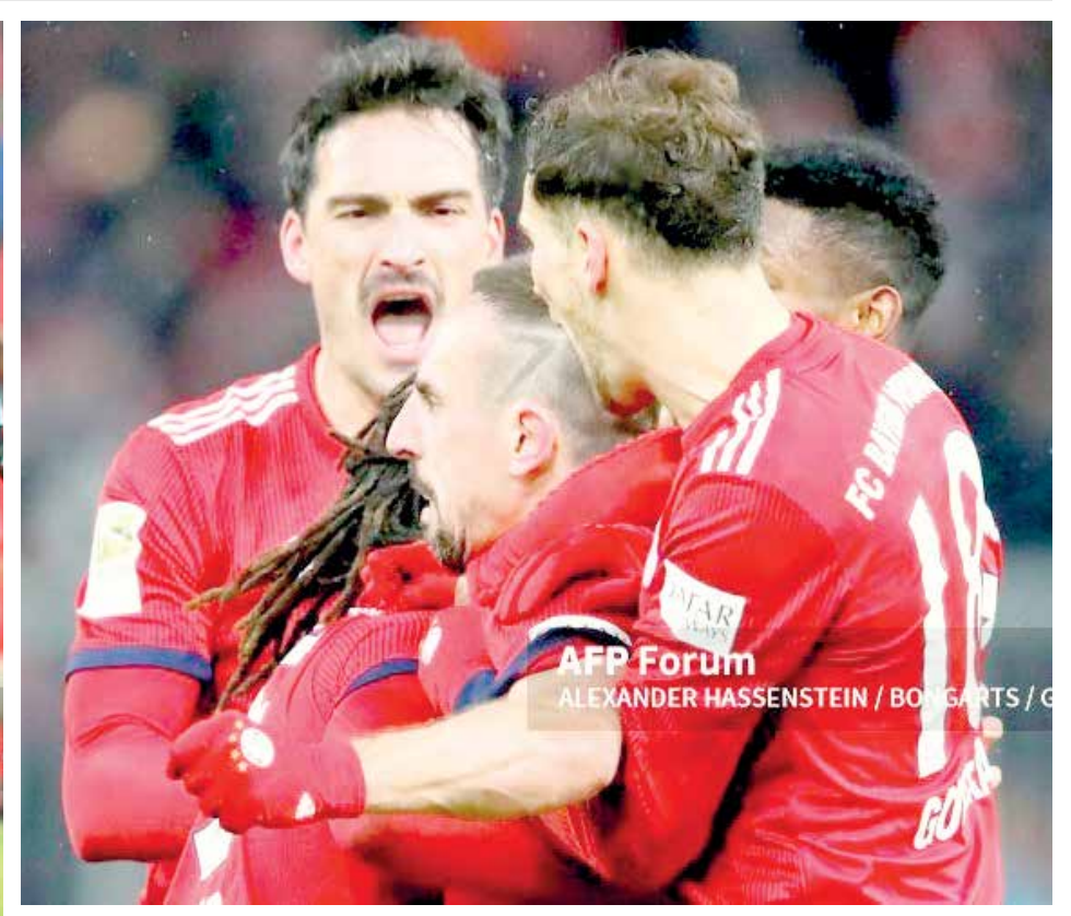
Franck Ribery of Bayern Muenchen celebrates scoring the opening goal with his team mates during the Bundesliga match between FC Bayern Muenchen and RB Leipzig at Allianz Arena on on Wednesday