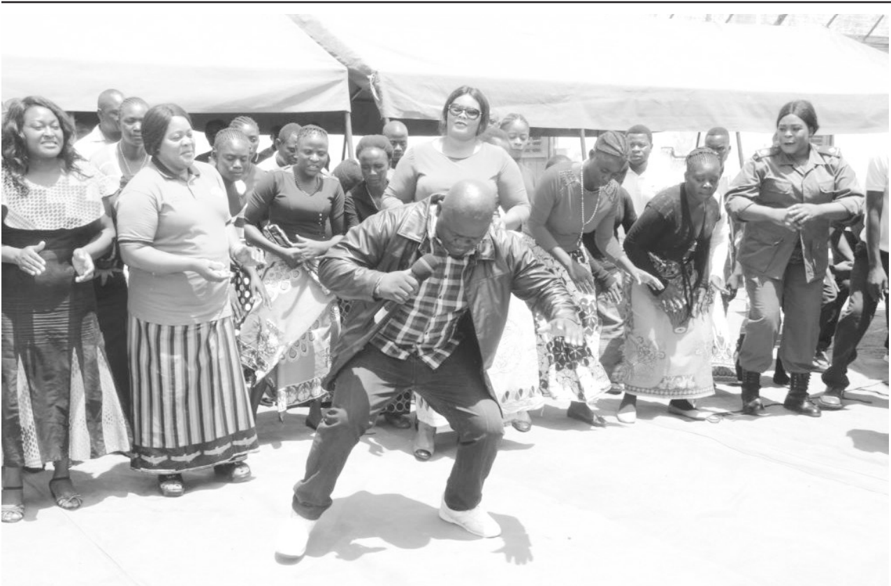
Lusaka Central Correctional Facility choir sings during the Service Chiefs special Christmas visit on December 25, 2018

consortium of political parties. PF should discuss its own internal wrangles and stop discussing the opposition alliance. PF will write off the opposition alliance, but we mean well. This criticism will make us strong. We are ready to brave the storm. PF and its agents will try and divide the alliance, but we are above board and will soldier on,” he vowed. Musenge stated that PF members should instead discuss how they would oust President Edgar Lungu at their forthcoming 2020 party convention. “Instead of discussing and disparaging the alliance, the PF should discuss the shame and mediocrity President Lungu has brought to Zambia. PF members should discuss how this regime will dismantle the debt Zambia is facing. The PF should further discuss the stinking corruption being perpetuated by Mr. Lungu and his cohorts,” stated Mwenya. “We firmly believe that a united opposition is in the best interest of our great country on matters of national interest. We know that the Lungu regime will use all available tricks and instruments to frustrate our initiatives. But with God on our side, we shall persevere. Negative rantings will not make the leadership of the NDC to leave the opposition alliance. We have entered the opposition alliance with open hands and have not made any preconditions.”