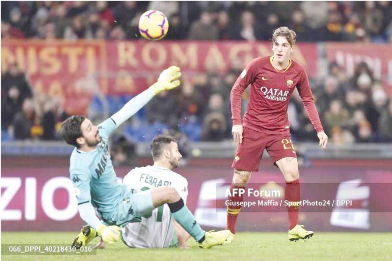
Nicolo Zaniolo of AS Roma scores third goal during the Italian championship Serie A football match between AS Roma and Sassuolo on December 26, 2018 at Stadio Olimpico in Rome, Italy