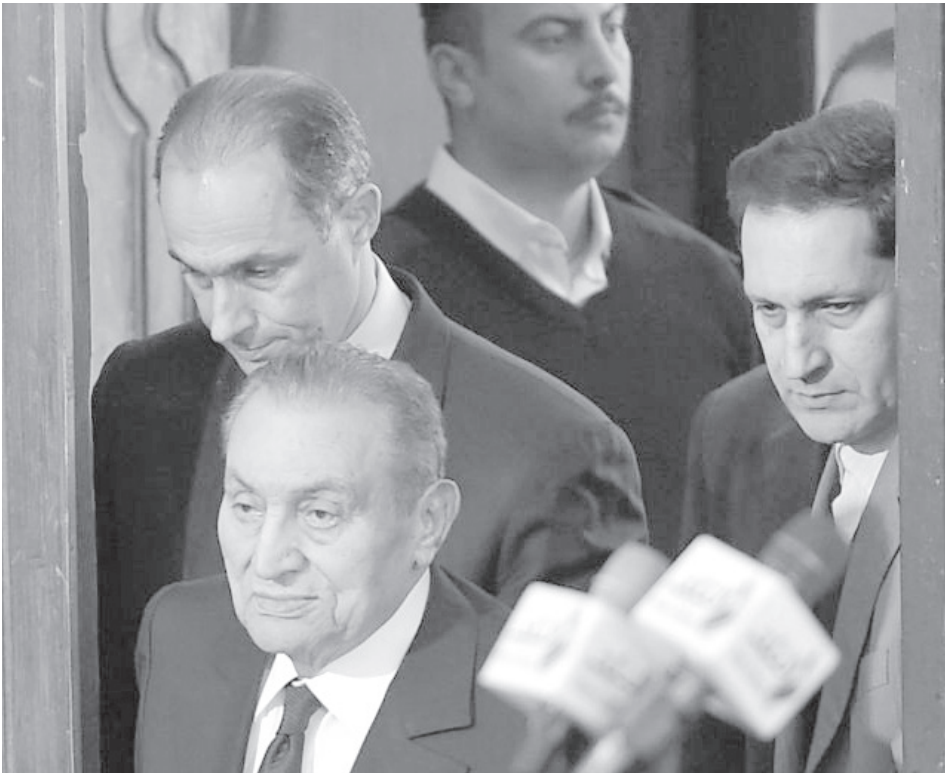
Former Egyptian president Hosni Mubarak (C, front), who was ousted following a popular uprisal in 2011, is escorted by his two sons Alaa (C, behind) and Gamal (L) as he testifies during a session in the retrial of members of the now-banned Muslim Brotherhood over charges of plotting jailbreaks and attacks on police during the 2011 uprising, at a make-shift courthouse in southern Cairo on December 26, 2018.