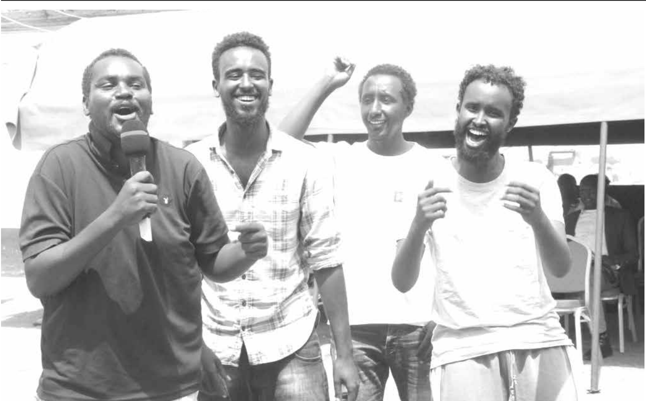
Inmates at Lusaka Central Correctional Facility perform when the Service Chiefs visited them on December 25, 2018