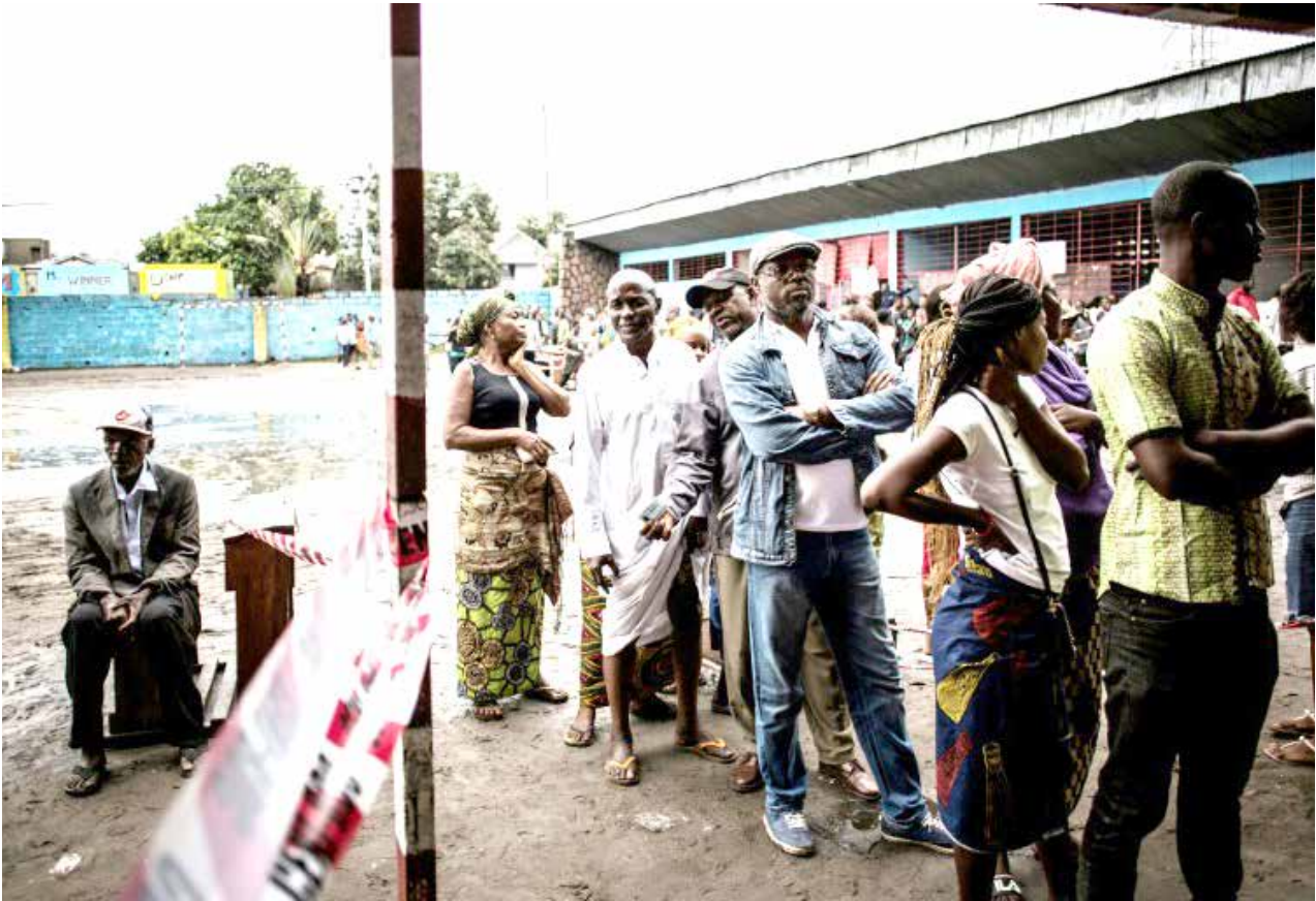
Voters wait in line to cast their ballot in the rundown Kinshasa district of Victoire

Presidential elections that will shape the future of one of Africa's biggest and most unstable countries were underway in the Democratic Republic of Congo on Sunday after a two-year delay. Queues formed at polling stations, where observers reported early hitches, including with electronic voting machines whose introduction has stoked tension. The vote gives the DRC the chance of its first peaceful transfer of power since it gained independence from Belgium in 1960. But the threat of violence is great, given organisational problems and suspicion of President Joseph Kabila, who refused to quit in 2016 after his two-term limit expired. The election's credibility has been strained by repeated delays, risk of problems on polling day and accusations that the voting machines will yield a rigged result. On election eve, talks aimed at averting violence after the vote broke down. Opposition frontrunners Martin Fayulu and Felix Tshisekedi refused to sign a proposed code of conduct with Kabila's preferred successor, Emmanuel Ramazani Shadary. They accused officials with the Independent National