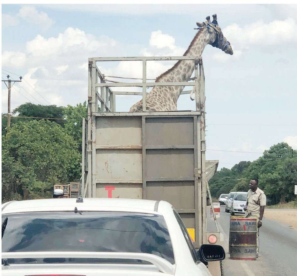
A traffic officer interrogates a wildlife transporter at a check point along Great East Road near the Barn Motel in Lusaka