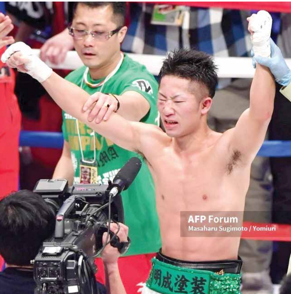
Japanese Takuma Inoue celebrates after beating Thai Petch CP Freshmart (Tasana Salapat ) in the WBC interim bantamweight match at Ota Ward Gymnasium in Ota Ward, Tokyo on Dec. 30, 2018.