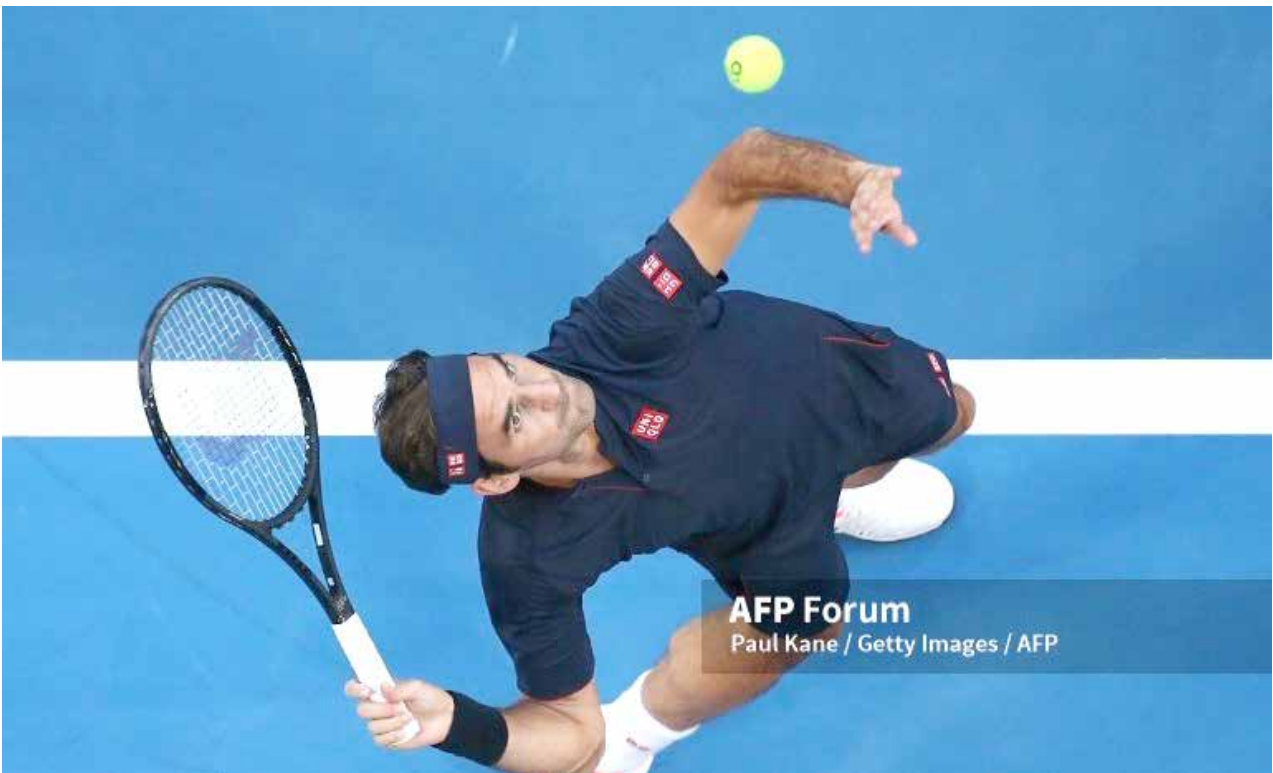
Roger Federer of Switzerland serves to Cameron Norrie of Great Britain during day two of the 2019 Hopman Cup at RAC Arena on December 30, 2018 in Perth, Australia