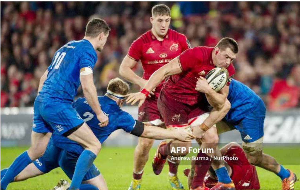
CJ Stander of Munster tackled by James Tracy of Leinster during the Guinness PRO14 match between Munster Rugby and Leinster Rugby at Thomond Park in Limerick, Ireland on December 29, 2018