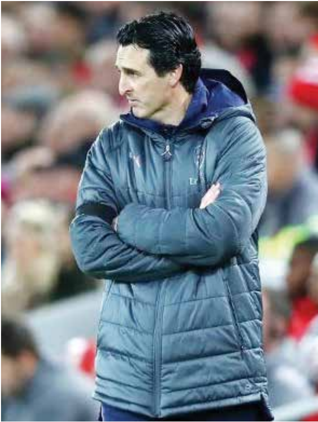
Left: Roberto Firmino of Liverpool scores his sides second goal during the Premier League match against Arsenal FC at Anfield on Saturday. Right: Arsenal manager Unai Emery watches his side succumb to a 5-1 defeat