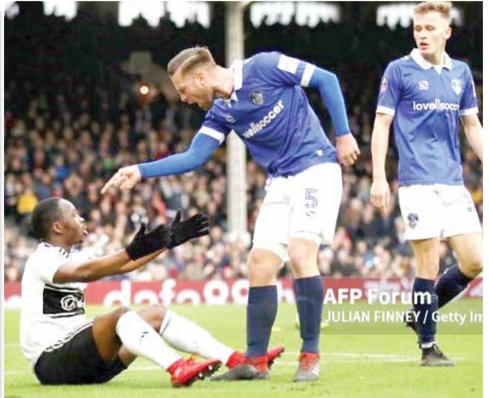
Jordan Lyden of Oldham Athletic argues with Neeskens Kebano of Fulham during the FA Cup Third Round match between Fulham and Oldham Athletic at Craven Cottage yesterday.

Japanese star Kei Nishikori claimed his first title since 2016 when he downed Russia's Daniil Medvedev 6-4, 3-6, 6-2 in the final of the Brisbane International on Sunday. The Japanese star had not won a tournament since Memphis in 2016 and was hampered by a wrist injury the following year which forced a break from the 2018 tour. He was runner-up in Brisbane in 2017 but went one better this year in a superb final. Nishikori dominated his Russian rival throughout, despite a slight hiccup when one poor service game cost him the second set. The second seed started slowly and went down 0-3 to the Russian. But he recovered to break back and then seized the advantage at 3-3 when he broke Medvedev again, taking the first set in 42 minutes. Nishikori was all over the Russian in the second set, his powerful and well-directed groundstrokes forcing Medvedev into errors. Medvedev held on against Nishikori's multiple chances to break at 2-2 and 3-3 and took advantage of his opponent's poor service game to break ahead. "I felt like in the second set I was a little bit, like waiting too much and I couldn't convert all the chances I had," the Russian said. "And he did really well the last game, I mean the 4-3 game. He took the risk and he did well and credit to him for second set.