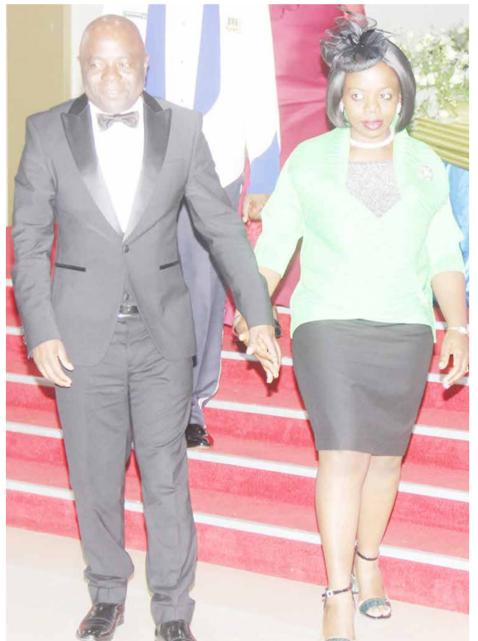
Home Affairs Minister Stephen Kampanyongo with wife arrive at the 2018 Zambia Police Service national annual ball at ZNS Chamba Valley banquet hall in Lusaka on January 4, 2019

"I think let's change the politics in Lusaka. Those who are voicing out should not be attacked. I am hurt and I have a scar on my back. This scar is for the people that we are speaking for."