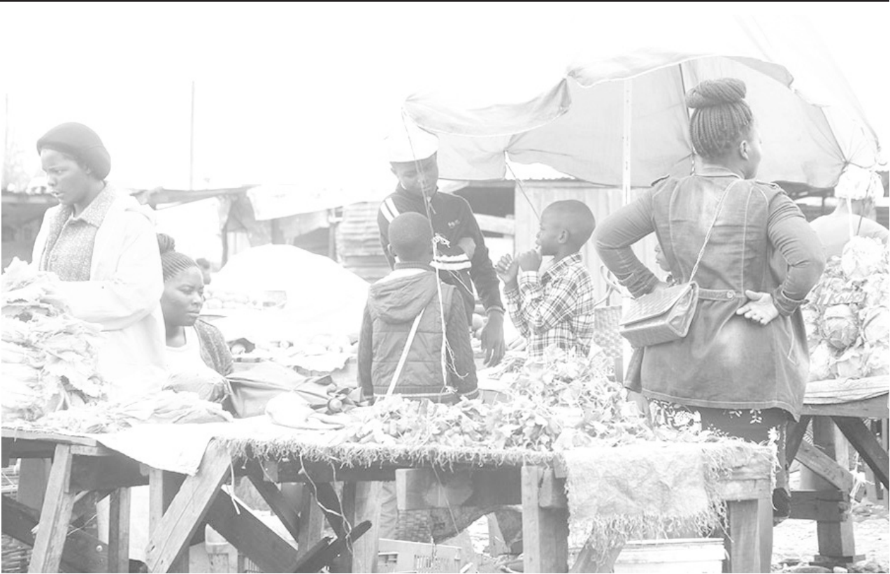
Traders in Bauleni’s Katambalala Market in Lusaka brave the rains as they continued trading in an open space due to lack of shelter

to have committed resulting in his death. He is further seeking damages for unlawful deprivation of life of the deceased, damages for loss of expectation of life and future earnings, funeral expenses in the sum of K30,000, exemplary damages arising out of Mwamba’s unlawful actions in the sum of K2,500,000, any other reliefs, interest and costs.