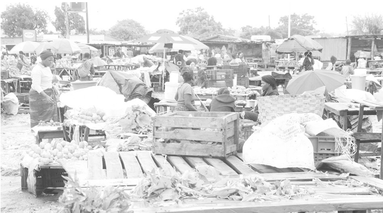
Traders in Bauleni's Katambalala Market in Lusaka brave the rains as they continued trading in an open space due to lack of shelter