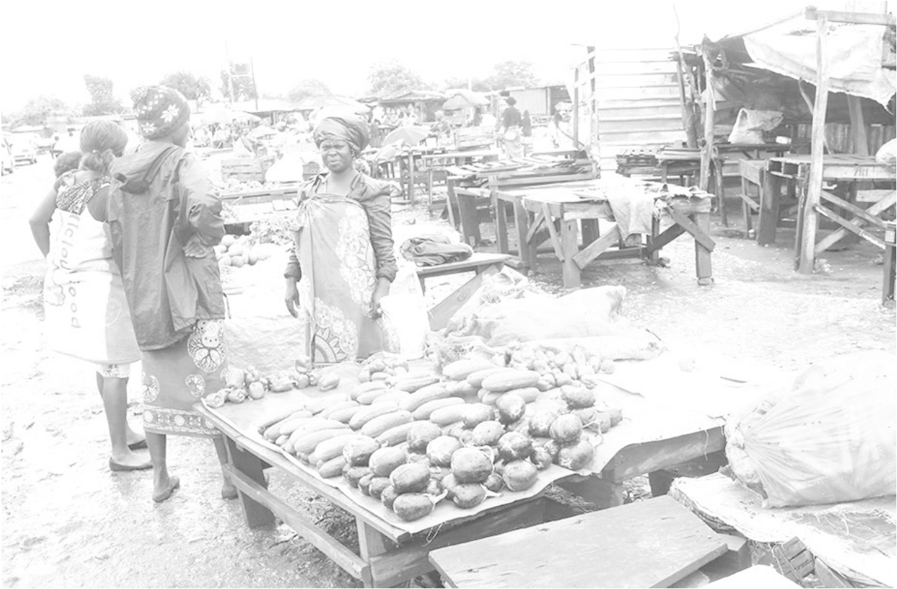
Traders in Bauleni’s Katambalala Market in Lusaka brave the rains as they continued trading in an open space due to lack of shelter - Picture by Tenson Mkhala

meant for orphans and vulnerable children, grants for schools in Kalabo and transportation of maize to various schools under the feeding programme.” Katonga added that DEC seized various assets from the duo’s money laundering activities. “The duo further engaged themselves in money laundering activities and acquired various properties, among them a motor vehicle, farm animals and household goods, which have since been seized by the Commission,” stated Katongo. “The two suspects are on police bond and will appear in court soon.”