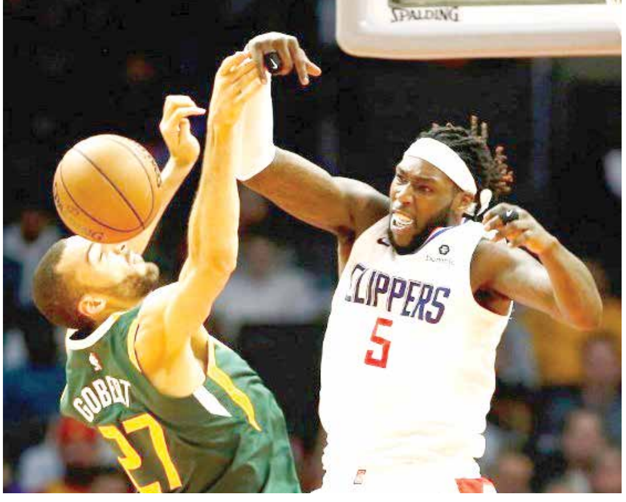
Montrezl Harrell #5 of the Los Angeles Clippers battles Rudy Gobert #27 of the Utah Jazz for a loose ball during the second half of a game at Staples Center on Wednesday in Los Angeles, California. The Utah Jazz defeated the Los Angeles Clippers 129-109