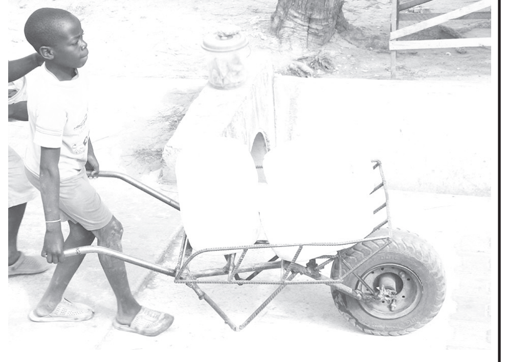
Water blues: A boy pushing a wheelbarrow with 20 liter containers of water in Lusaka's Mtendere Compound

The illegal bushmeat trade has been reported as the biggest threat to wildlife populations in Zambia and the region, even over and above the ivory and rhino horn trade.