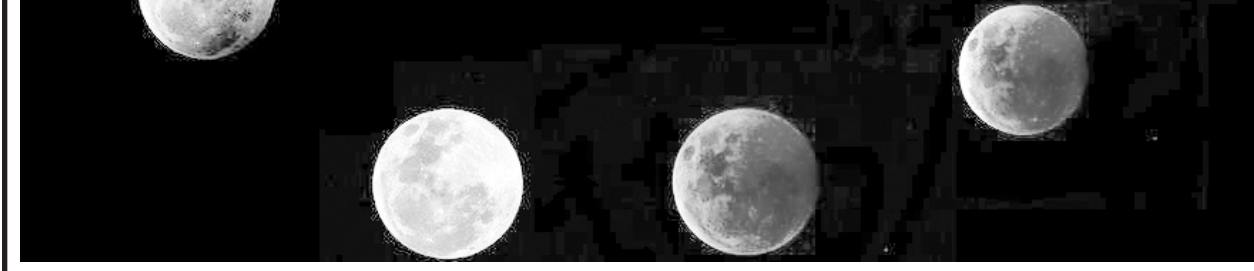
The start of the total lunar eclipse seen in San Diego, California. Stargazers have been scanning the skies for sightings of a highly unusual lunar eclipse, which began on Sunday night.

Growth has been easing for years, but concern over the pace of the slowdown in China has