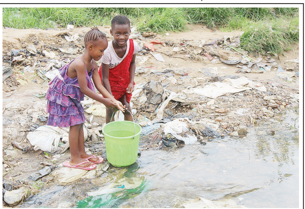
Children of Lusaka's Ng'ombe Compound draw water from a nearby stream within the township over the weekend

challenges faced by other countries when he was failing to solve problems of his own country. Story page 4